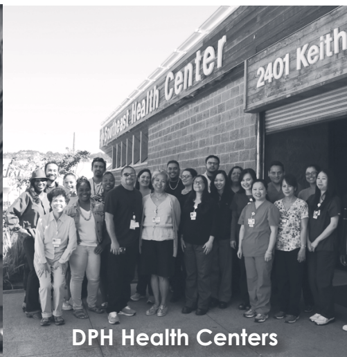
DPH Health Centers