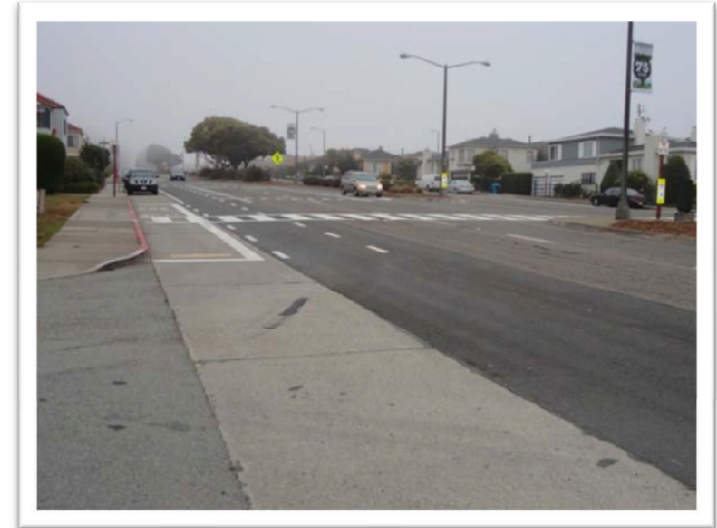
Sloat Blvd. and Forest View Drive: view to the west