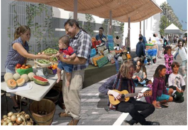
Community events to activate Mercado Plaza