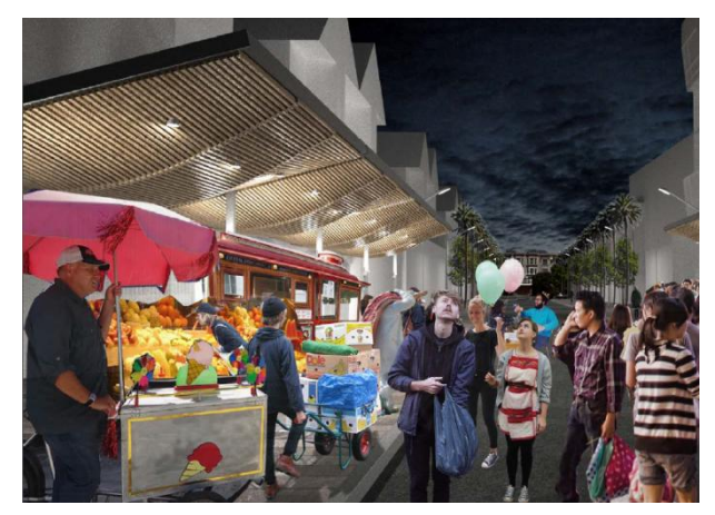
Pergolas act as shop canopy for merchants

<u>Schedule:</u> Construction Begins: December 2014 Construction Completed: July 2015