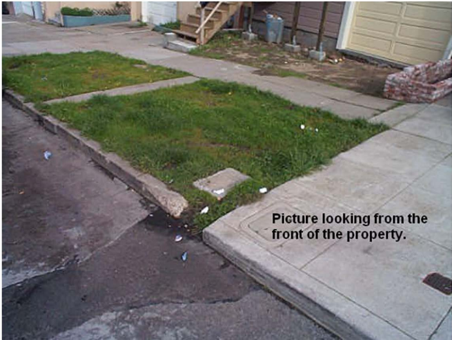
Picture looking from the front of the property.