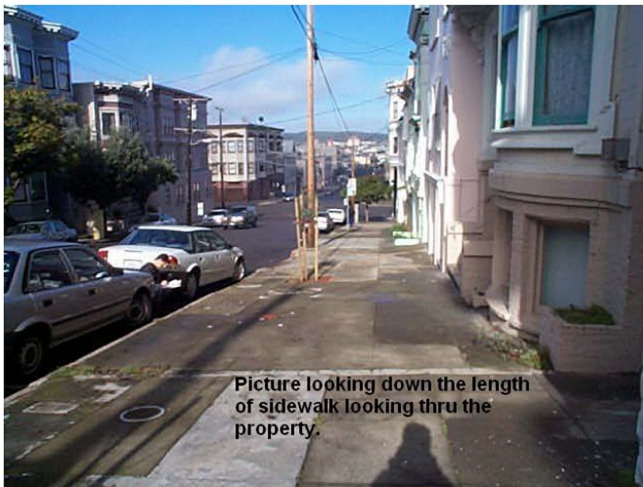
Picture looking down the length of sidewalk looking thru the property.