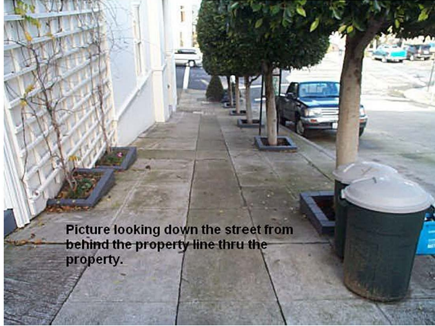
Picture looking down the street from behind the property line thru the property.