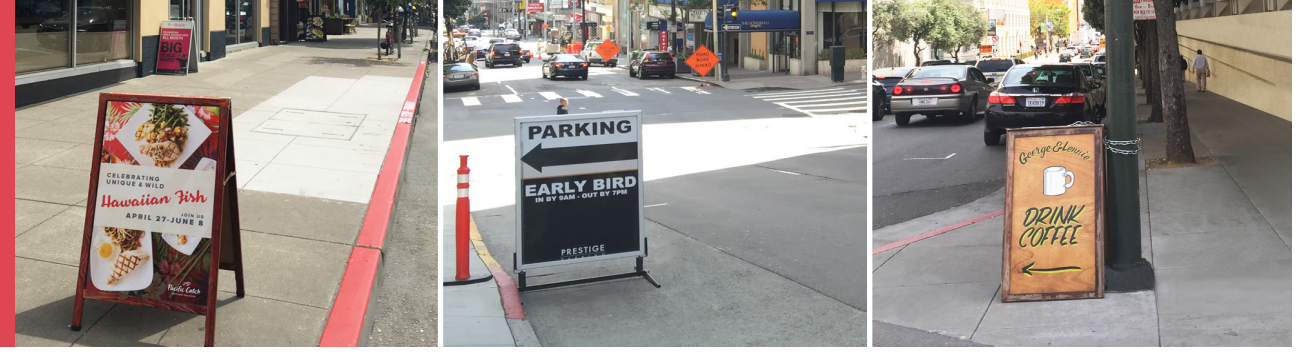
VIOLATION: A-frame signage is obstructing path of travel

Violations of Municipal Police Code Section 63(a) or Public Works Order No. 181386 can result in enforcement and corrective action which may incur fines up to $300 per incident.