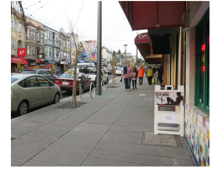
New sidewalks will provide a safe and comfortable shopping experience for pedestrians, and will remedy the steep cross-slope near Cal-Mart and Starbucks.