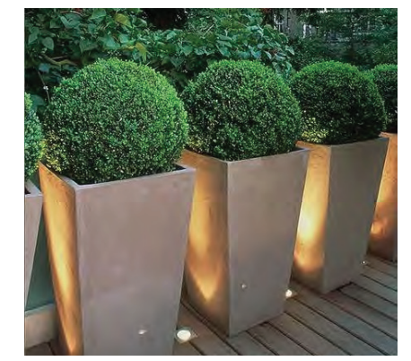
Storefront planters are designed to improve the consistency and visual aesthetics of the shopping center.