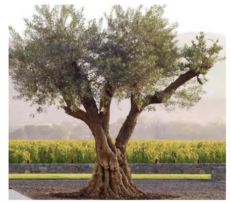
Ancient Olive Trees are proposed to be planted along the south side of California Street. Standard olive trees will be planted on the north side.

1 Dr. Carlton B. Goodlett Place, City Hall, Room 348 San Francisco, Ca 94102