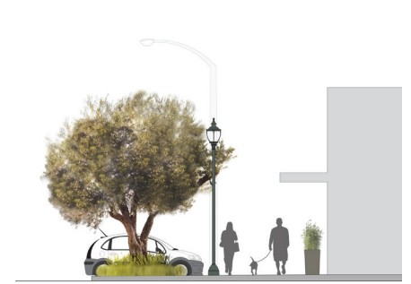
New pedestrian lighting will help the visibility of businesses along the street and provide a safer environment for pedestrians at night.