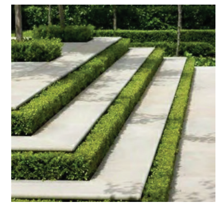
Topiary Hedges will be provided at the Locust street plaza to add greening and provide a buffer to California street traffic.