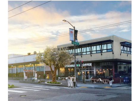
Proposed bus stop bulbout in front of Starbucks would make Muni more reliable by reducing the need to pull in and out of bus zones. It would also allow for additional pedestrian space and a more robust 'gateway' to Laurel Village.