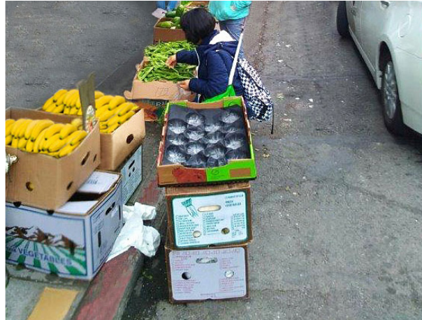
VIOLATION: Exceeding permissible use VIOLATION: Unsafe condition