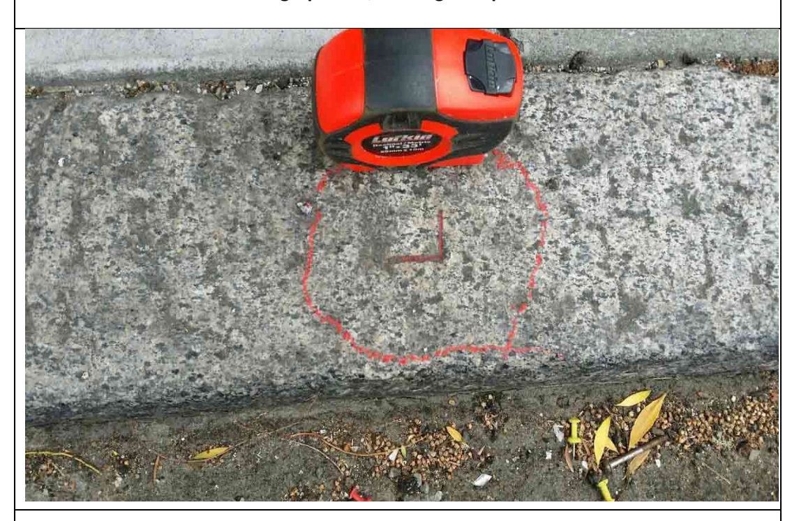
Photograph Two, looking along Property Line, Curb to Building