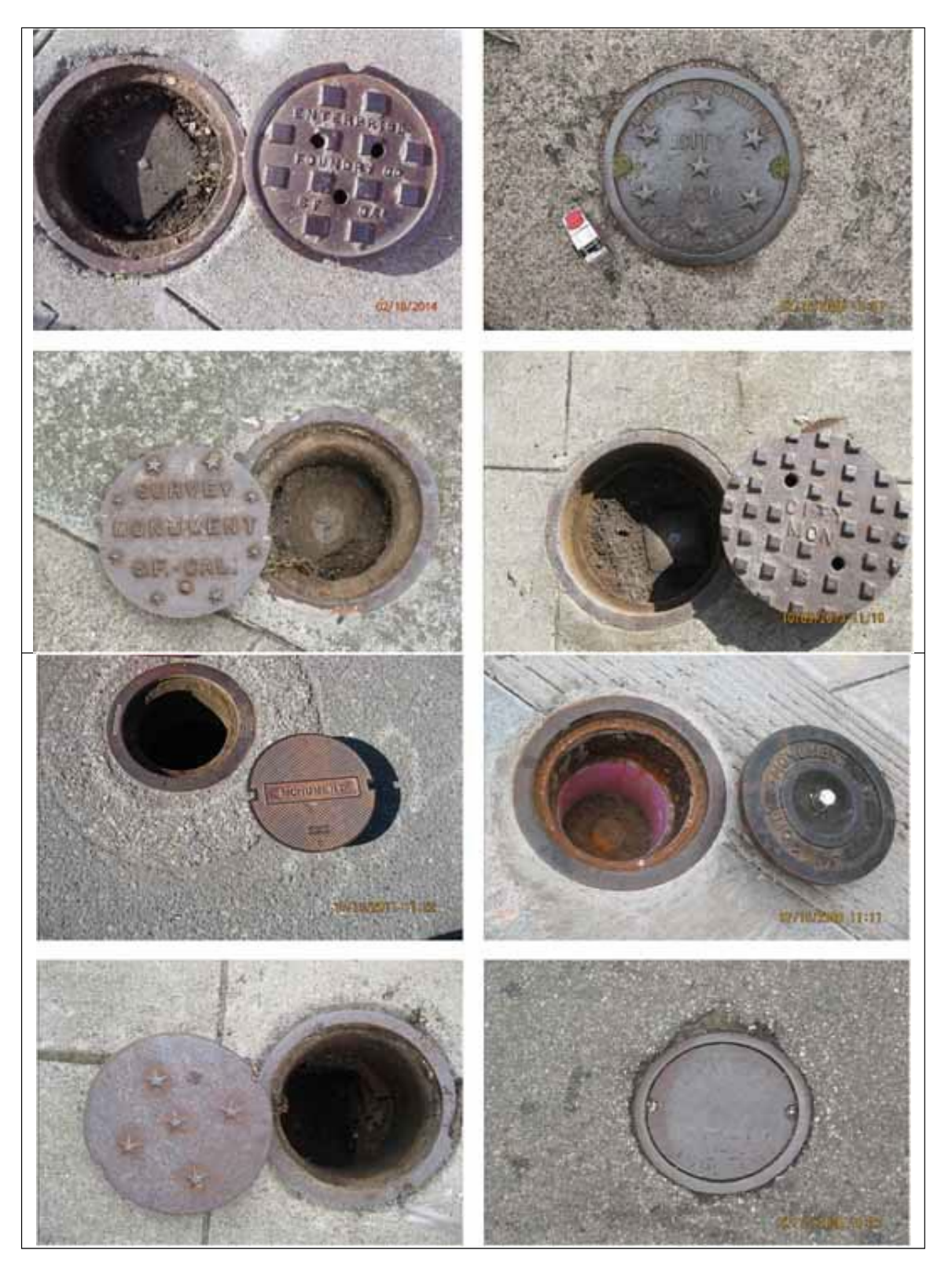
Figure 1 Some Typical Monuments with Well Casings