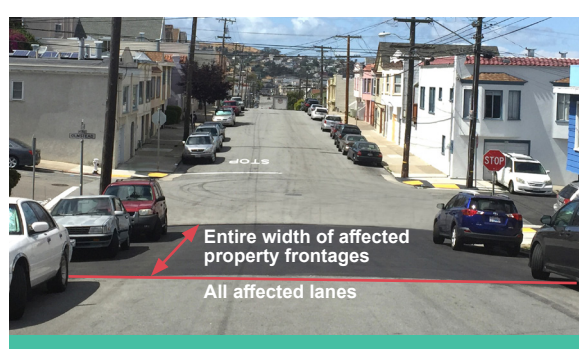
Acceptable/correct paving restoration

For more information on how to obtain a permit and additional excavation requirements, please refer to the Excavation Requirements brochure or www.sfpublicworks.org