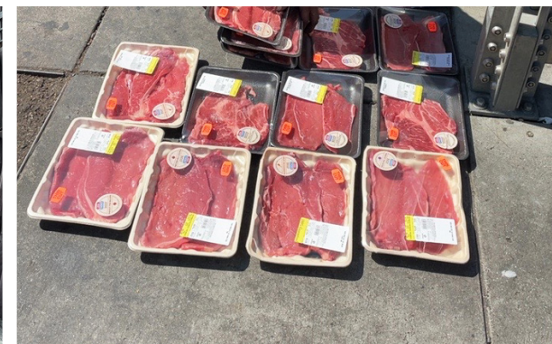
VIOLATION: Selling food or drinks not allowed by the program