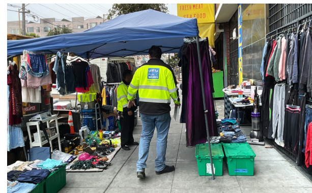
VIOLATION: Obstructing required path of travel