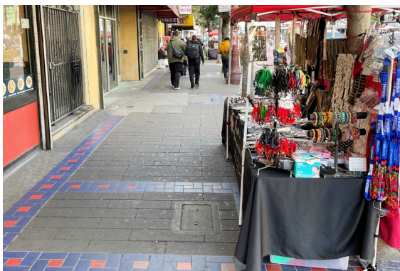
COMPLIANT: 6-foot, straight, unobstructed path of travel maintained

Vendors seeking to operate within the jurisdiction of the Port of San Francisco will, in addition to requiring a permit from Public Works, be subject to the siting and operating requirements specified by the Port.