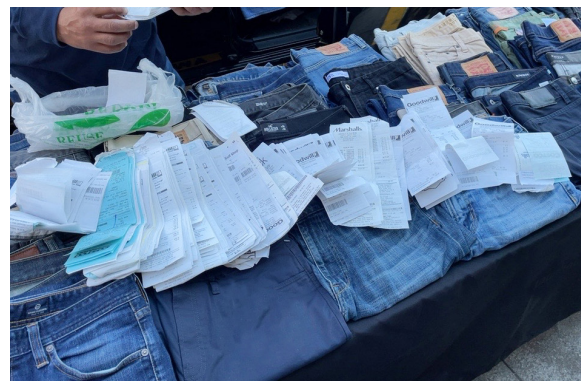
COMPLIANT: Proof of ownership readily available