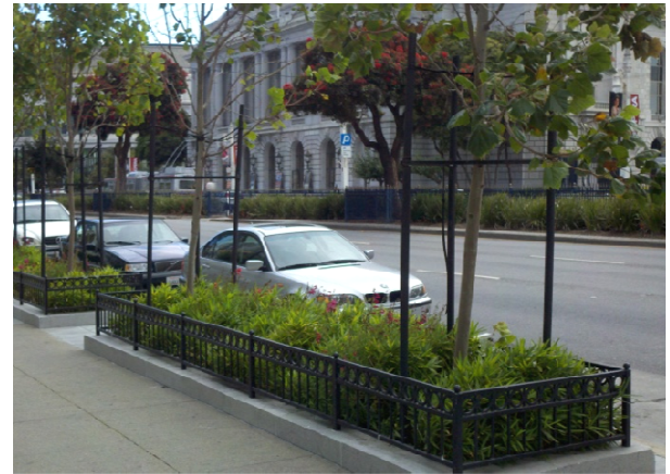
Raised planters with metal railing