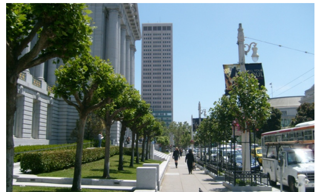
New trees and landscaping