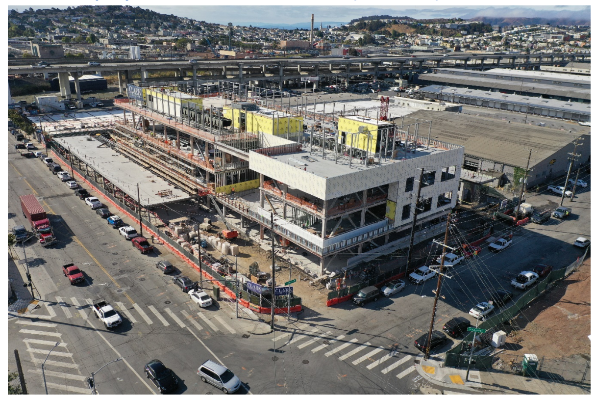
Aerial Photo of 1995 Evans Avenue (March 27, 2020)

Project Description: The project will relocate the SFPD Forensic Services Division (FSD) and SFPD Traffic Company (TC) to a site located at 1995 Evans Avenue, San Francisco. The amount of space requested for the Traffic Company was determined based on the Police Facilities Master Planning Study dated August 23, 2012.