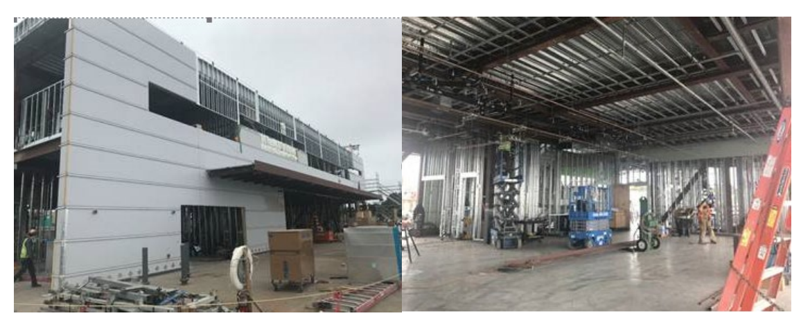
Installation of Centria Panels