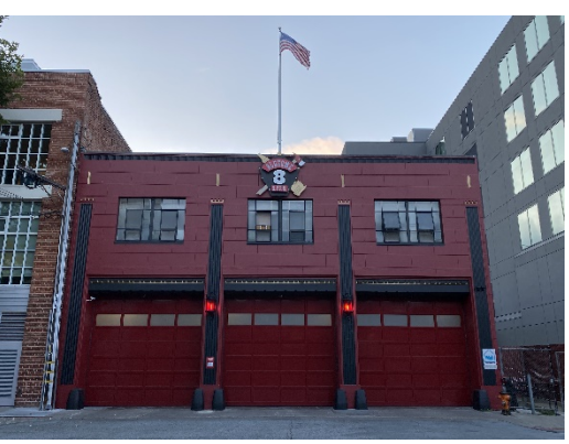
Station 8 – New Apparatus Bay Doors