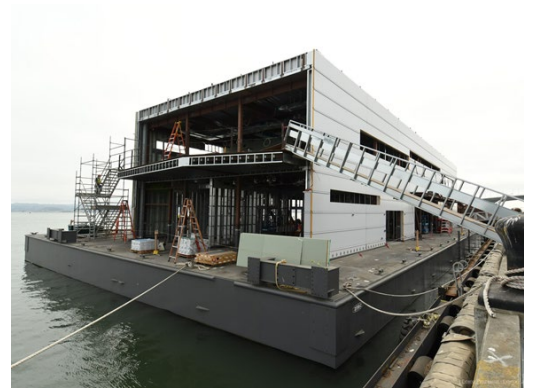
Fireboat Station 35 - Exterior Metal Panels