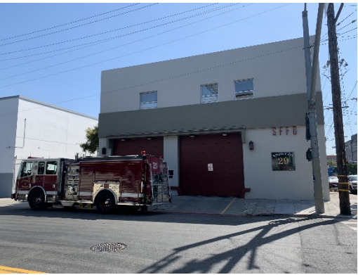
Station 29 – Exterior Envelope Complete