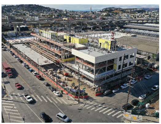
TCFSD – View of North and West Elevations