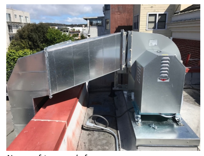
New roof-top supply fan. Quarterly Status Report

Projected substantial completion is January 2020.