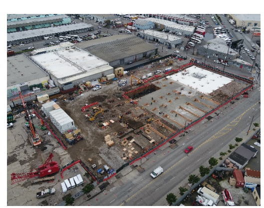
TCFSD - Mud Slab (December 17, 2019)