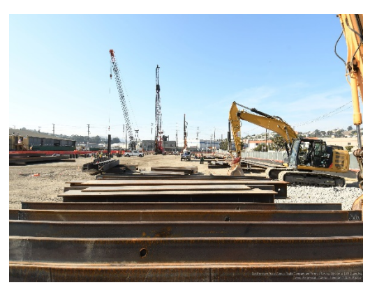
TCFSD – Foundation Piles (November 7, 2019)