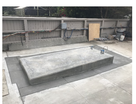
FS 31 – Concrete Pad for New Generator