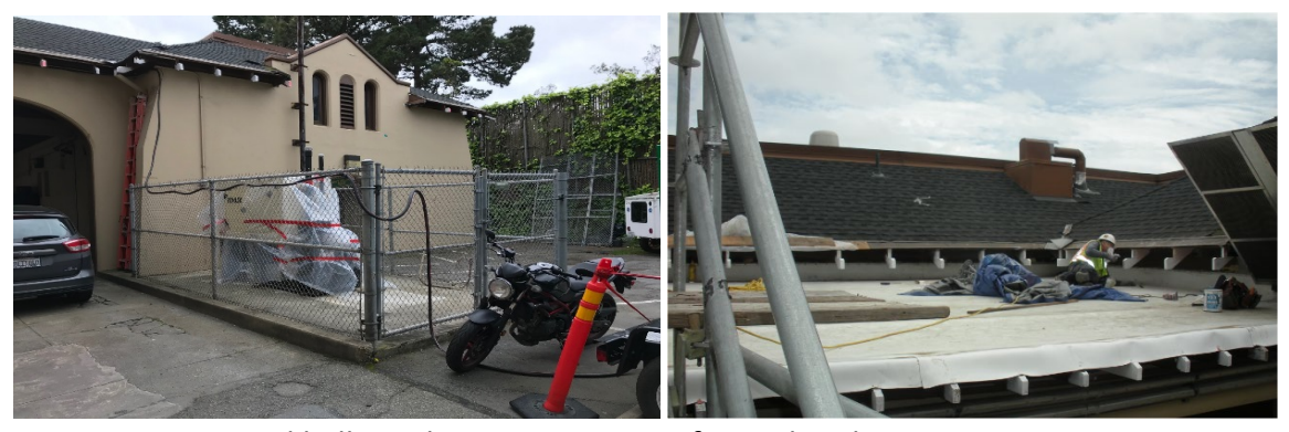
New generator and belly tank.