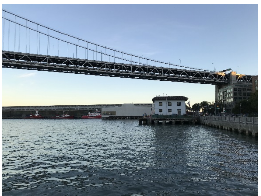
FS 35 – Demolition Complete (October 22, 2019)