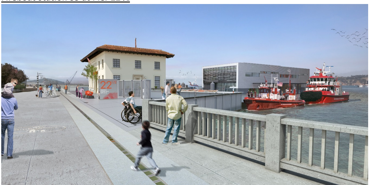
Embarcadero Perspective of West and South Elevations

Design-Builder: Swinerton-Power, a Joint Venture and Shah Kawasaki Architects