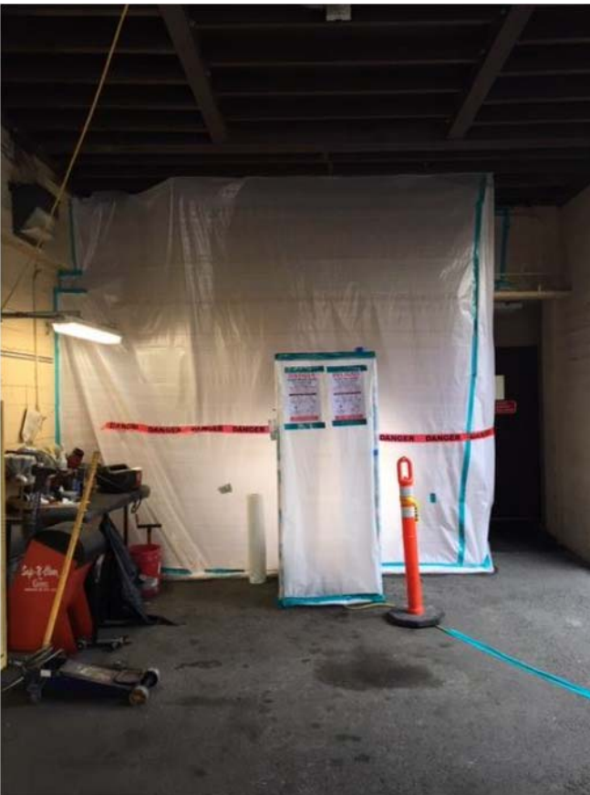
Existing brick in-fill wall was demolished.