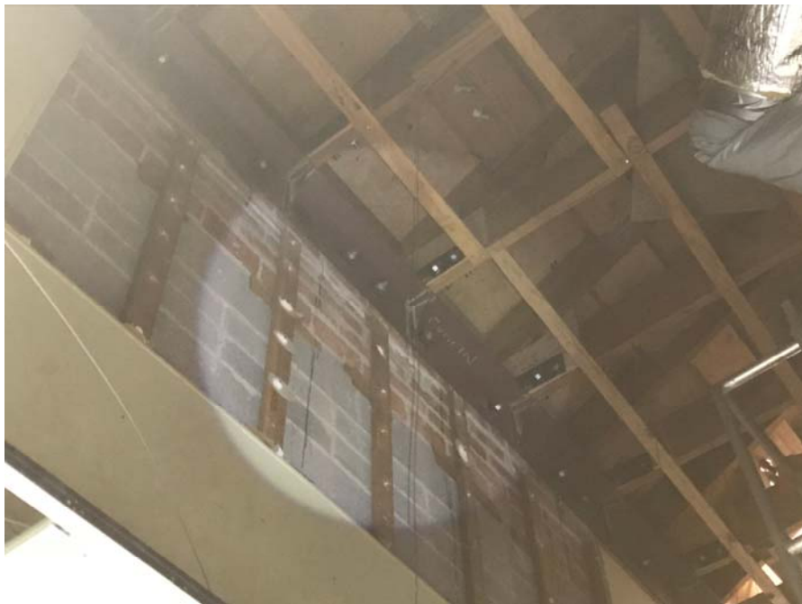
Structural reinforcement at perimeter wall to roof connection is completed.