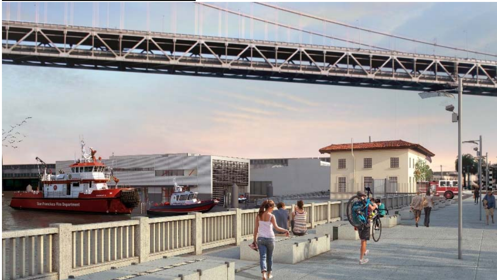
Current Concept Design by Shah Kawasaki Architects

Design-Builder: Swinerton-Power, JV & Shah Kawasaki Architects