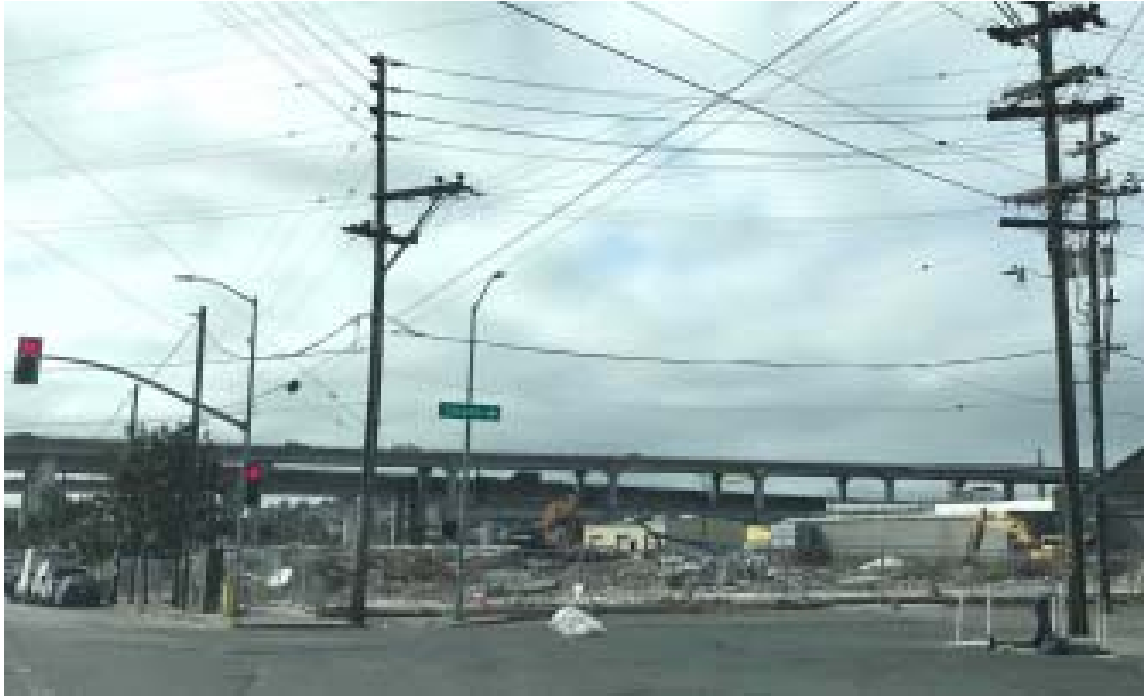
Demolition of Existing Bakery (July, 2018)

Project Description: The project will relocate the SFPD Forensic Services Division (FSD) and SFPD Traffic Company (TC) to a site located at 1995 Evans Avenue, San Francisco. The amount of space requested for the Traffic Company was determined based on the Police Facilities Master Planning Study dated August 23, 2012.