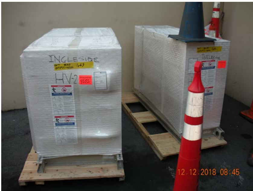
New HVAC equipment have been delivered to site and are ready to be installed.