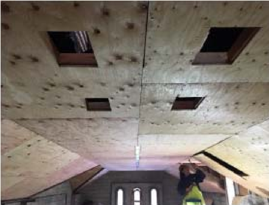
Structural work in attic.