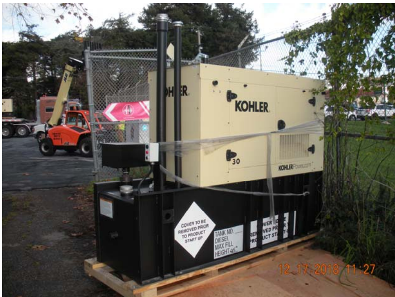
New back-up generator was delivered to site and ready to be installed.