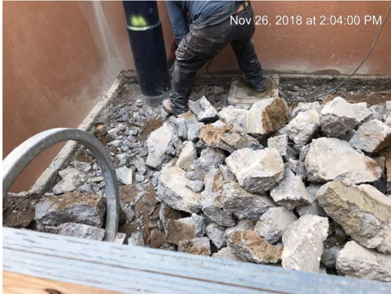
Left: Sidewalk has demolished for storm/sewer connection and repair.