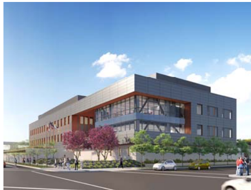
TCFSD – Civic Design Review Phase 2 Approved

sfpublicworks.org facebook.com/sfpublicworks twitter.com/sfpublicworks