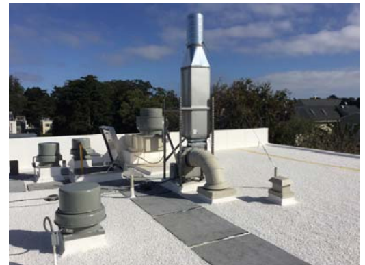
FS 22 Roof and Exterior Envelope – Complete