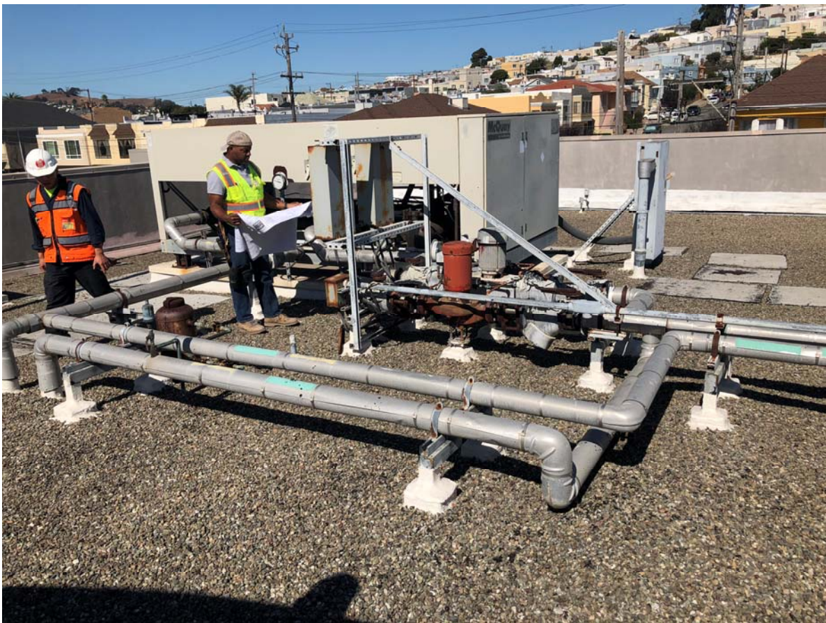
Existing HVAC unit on roof

The following was completed at Bayview Station: