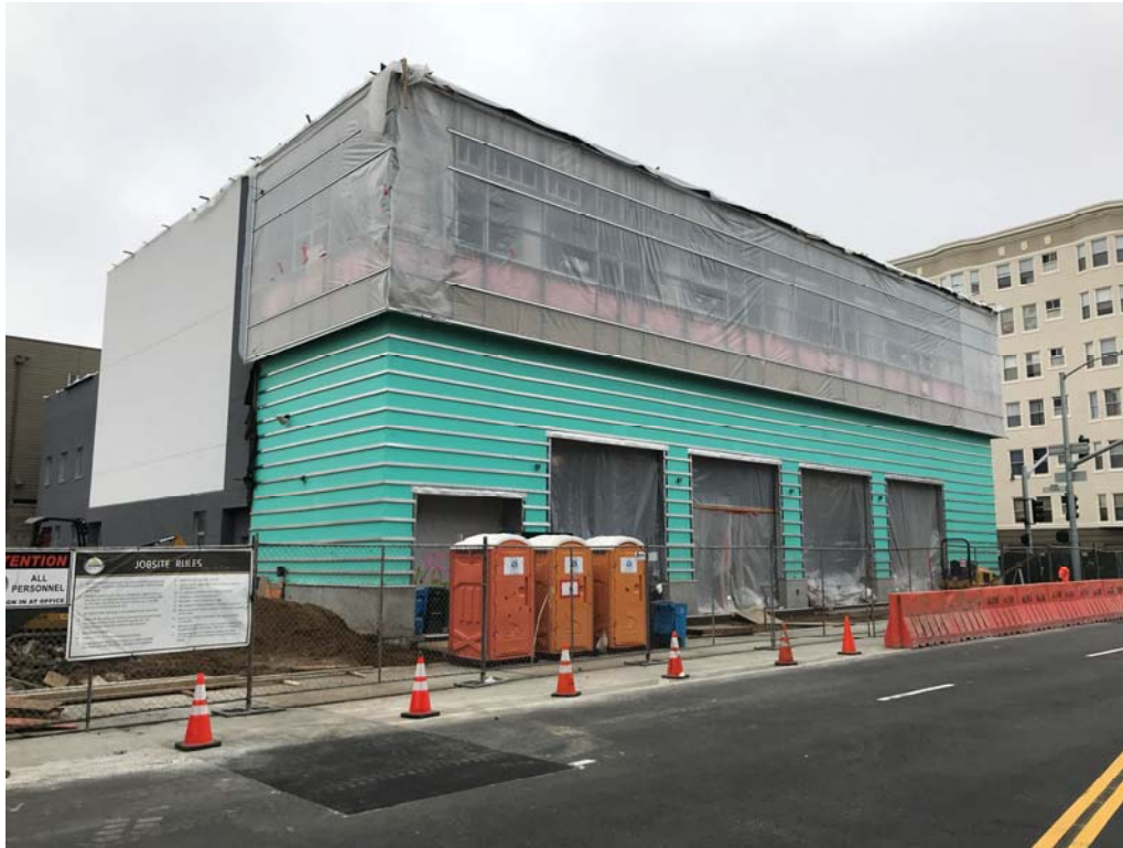
South and East Elevations at Webster Street (December 20, 2018)