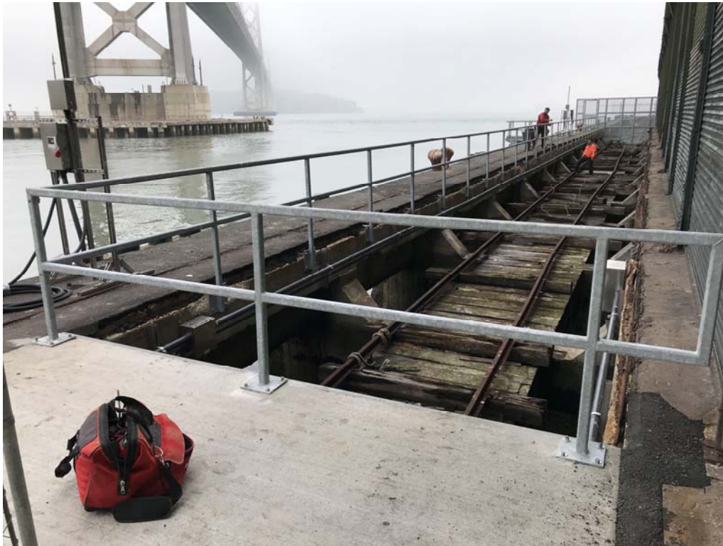
Installation of Safety Railing and Security Fence and Gate (December 20, 2018)