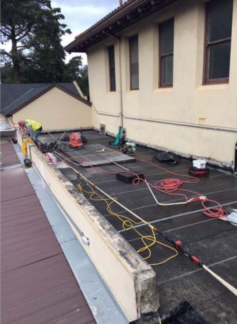
Existing HVAC equipment are removed from roof.