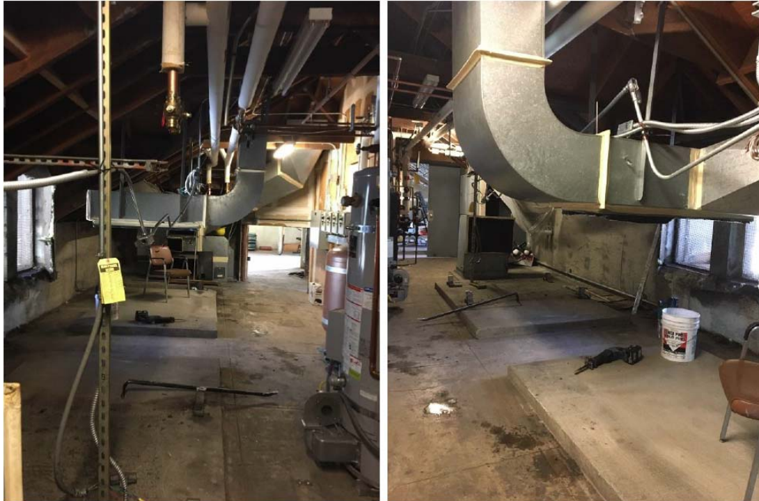
Existing HVAC equipment have been decommissioned and are removed from site.