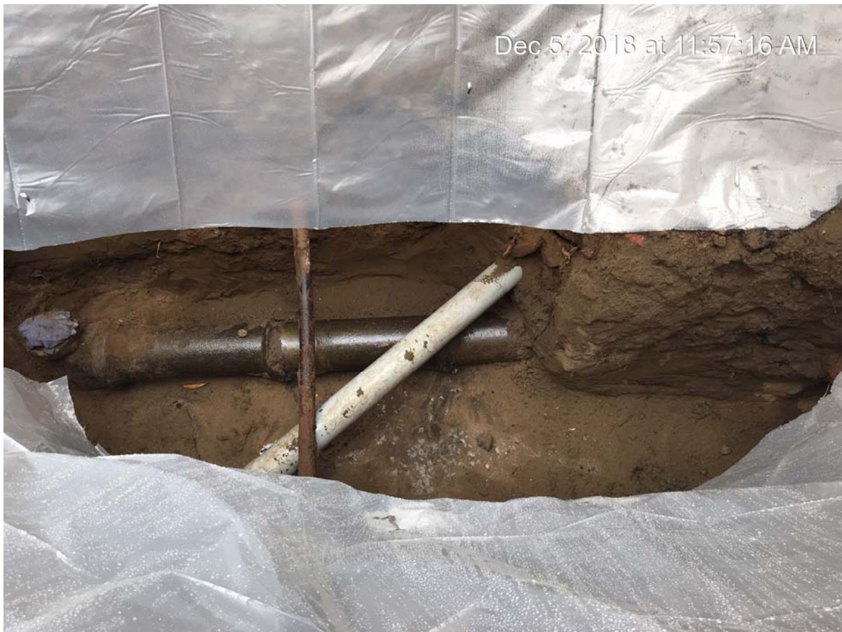
Bottom: existing storm / sewer connection exposed below grade.