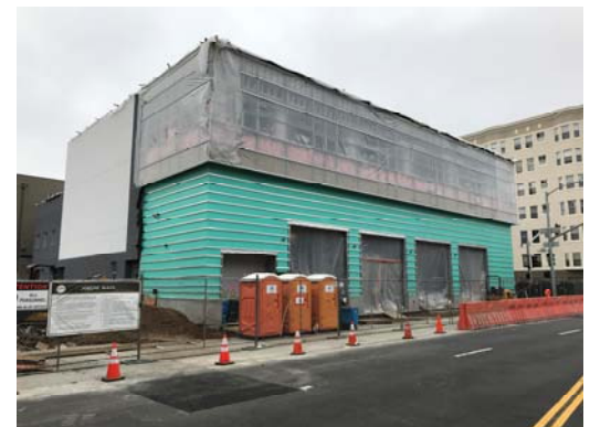
FS 5 – South and East Elevations at Webster St.