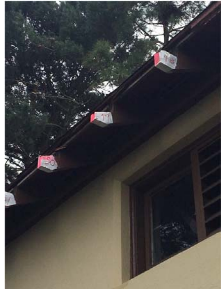
Existing rotted gutters have been demolished; rafter tail replacement is under progress.