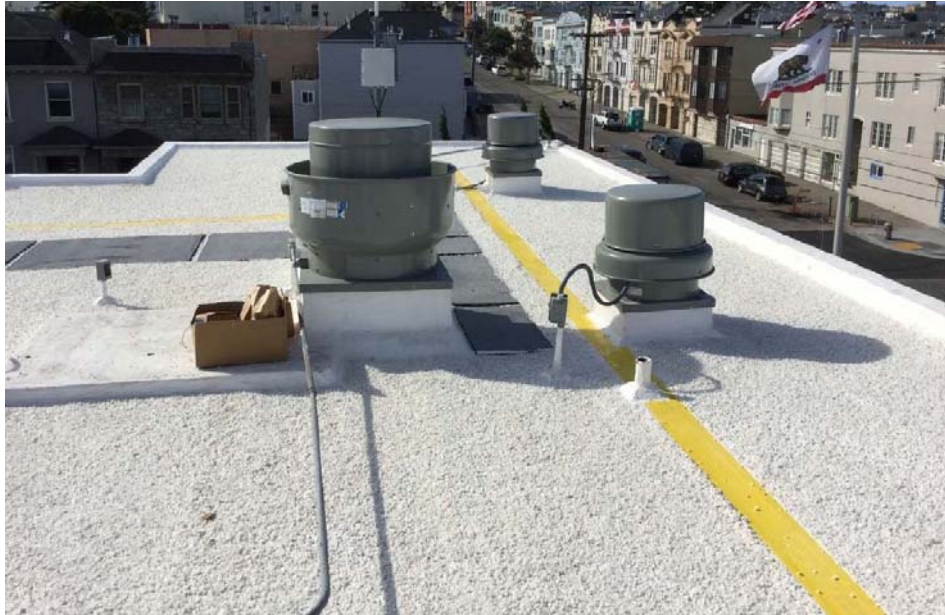
FS 22 Exterior Envelope, new roof