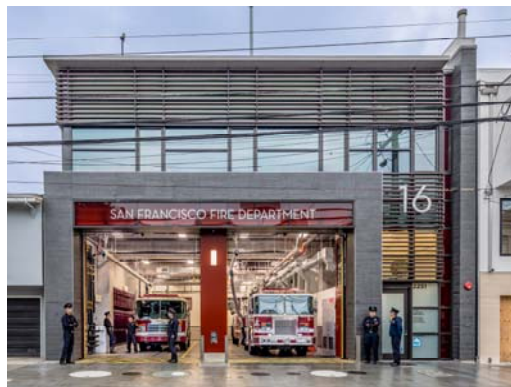
FS 16 – North Elevation at Greenwich St.