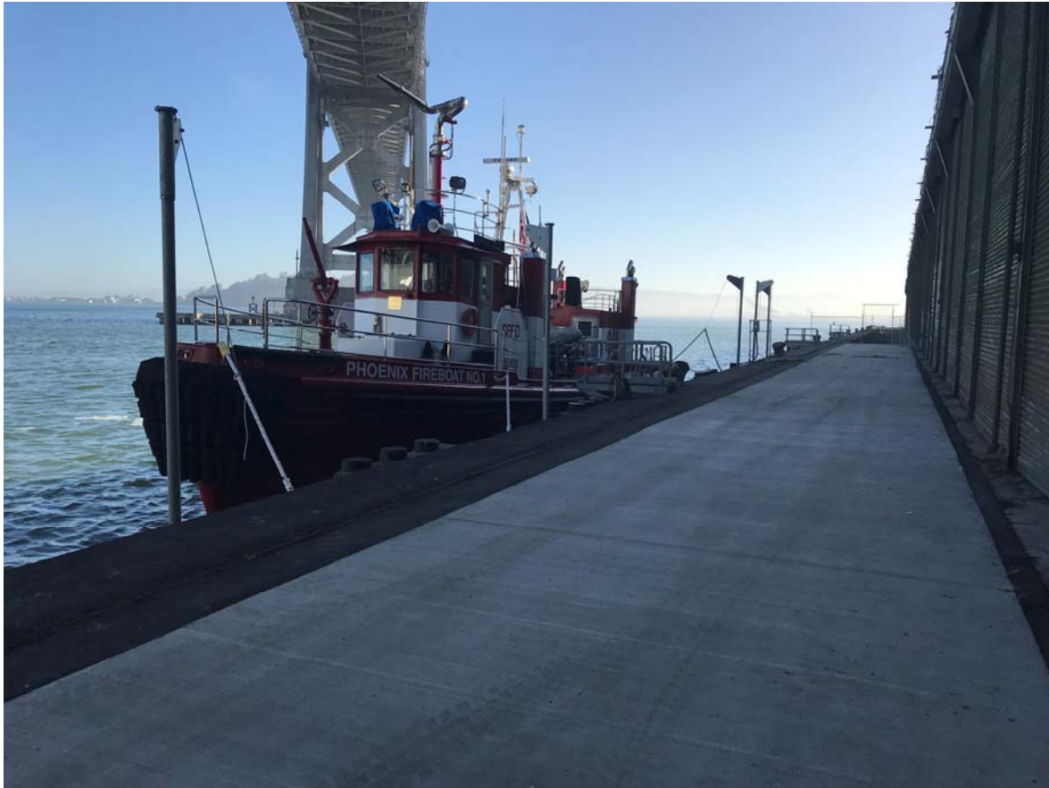
Phoenix Fireboat Moored at Pier 26 (March 28, 2018)