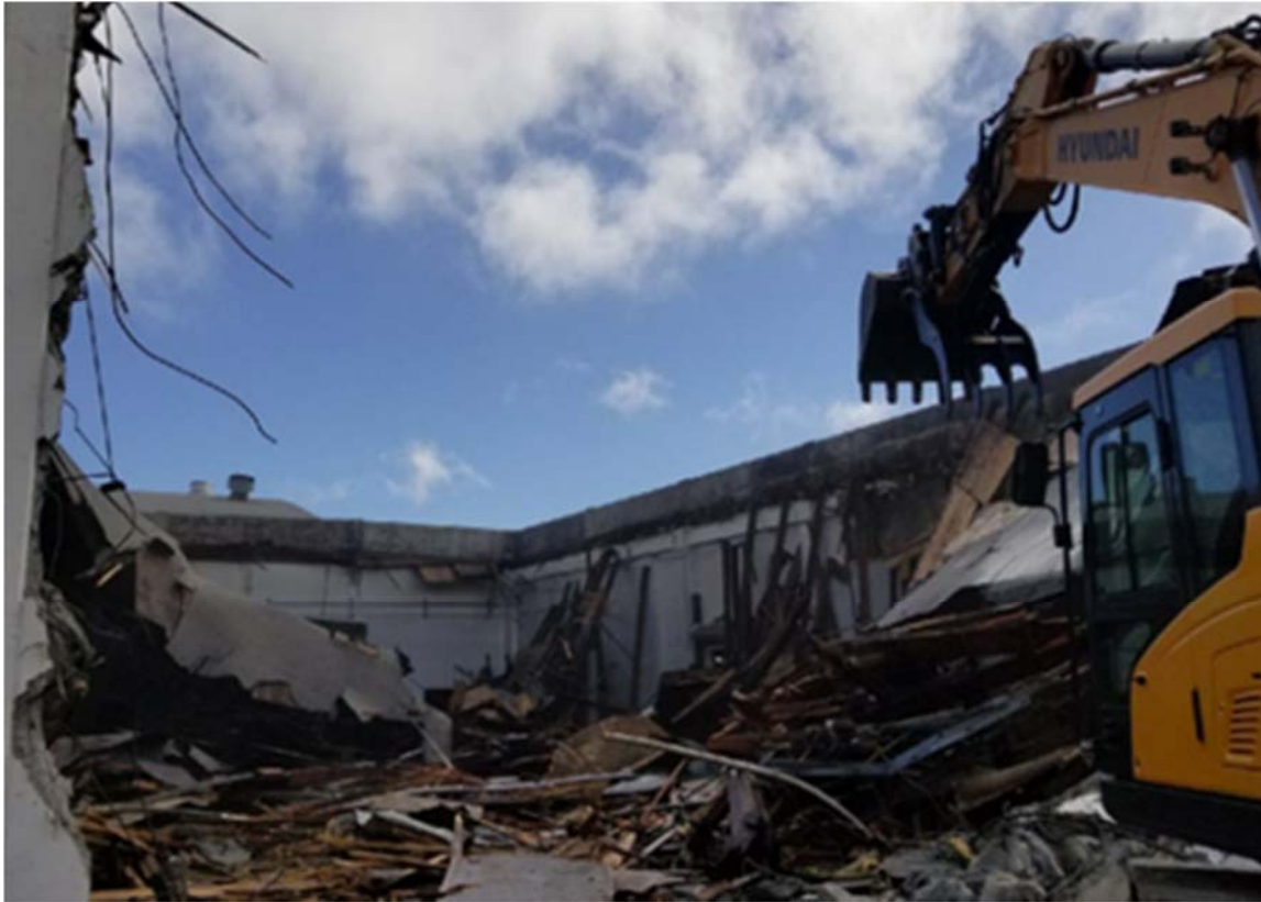
Demolition of Existing Bakery (May 9, 2018)

Project Description: The project will relocate the SFPD Forensic Services Division (FSD) and SFPD Traffic Company (TC) to a site located at 1995 Evans Avenue, San Francisco. The amount of space requested for the Traffic Company was determined based on the Police Facilities Master Planning Study dated August 23, 2012.