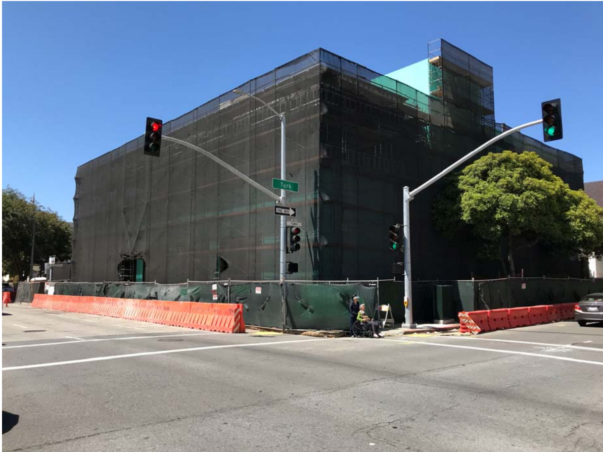
North and East Elevations at Turk/Webster Intersection