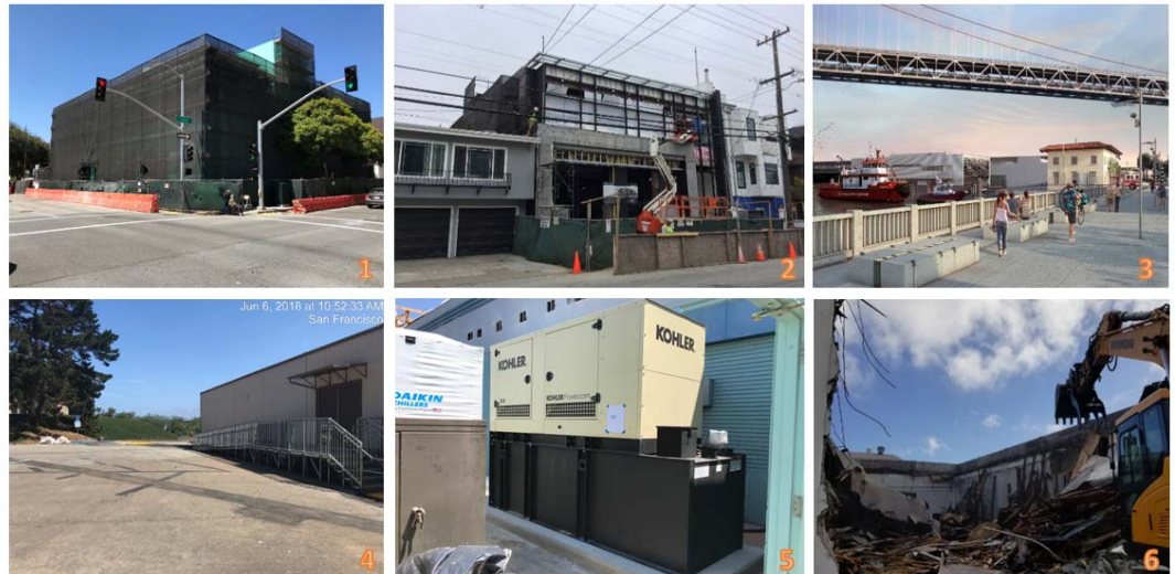
1) Station 5 North and East Elevations, 2) Station 16 Curtain Wall Installation, 3) Fireboat Station 35 Revised Concept Design by Shah Kawasaki, 4) New Firearms Simulator Training Facility, 5) Northern Station New Generator, 6) Traffic Company & Forensic Services Division Demo

sfpublicworks.org facebook.com/sfpublicworks twitter.com/sfpublicworks