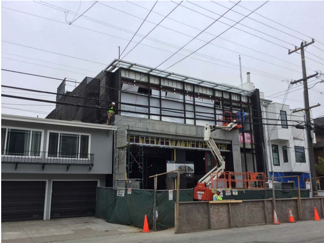
Curtainwall Install at North Elevation on Greenwich Street (June 27, 2018)