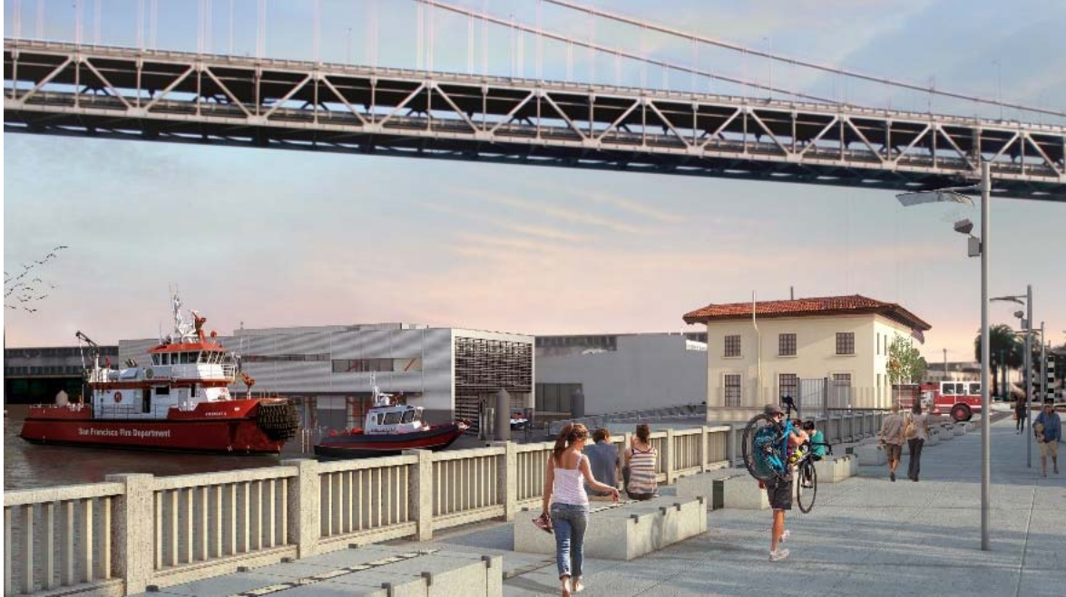
Revised Concept Design by Shah Kawasaki Architects