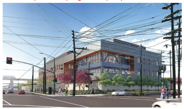
Design Rendering - View from Intersection of Evans Ave. & Toland St.

View progress photos and subscribe to this newsletter: sfearthquakesafety.org/motorcycle-police-and-crime-lab