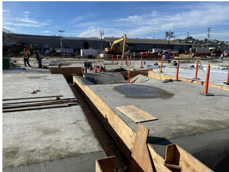
Mud Slab and Underground Utility Trench – December 31, 2019