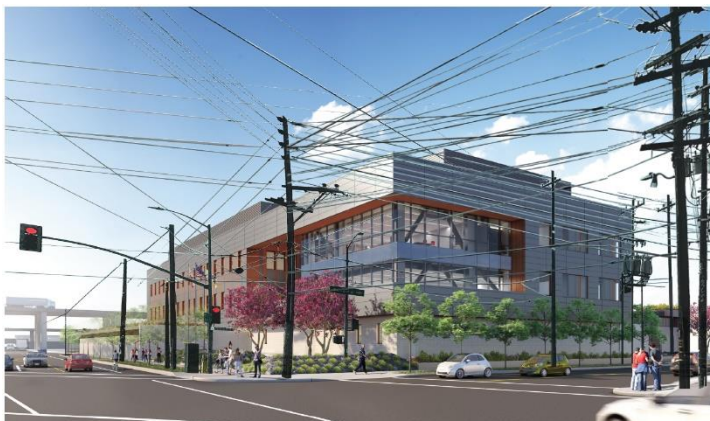
Design Rendering – View from Intersection of Evans Ave. & Toland St.