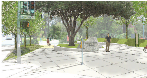
_____ Traditional Landing

1) Please select your preferred design concept for the 9 th Avenue & Lincoln Way Golden Gate Park plaza.