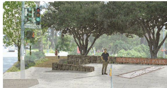
_____ Linear Landing

2) What are the most important elements of the design concepts for the entry design? As the project team continues through detailed design, we may need to adjust the scope in order to meet our budget. Please rank the project elements (1,2,3,4,5,6) in the order you would prioritize them, with 1 being the most important and 6 being the least important.