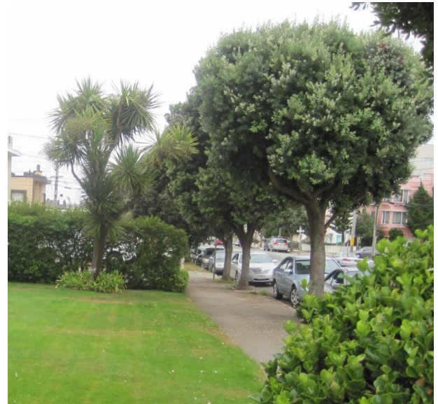
Increased street greening brings aesthetic improvements

The Point Lobos Streetscape Improvement Project is a joint effort by the San Francisco Department of Public Works and Municipal Transportation Agency to provide a safer, greener, and more aesthetically enhanced streetscape. The featured improvements will emphasize Point Lobos as a reimagined street, safe for pedestrians, cyclists, and motorists.