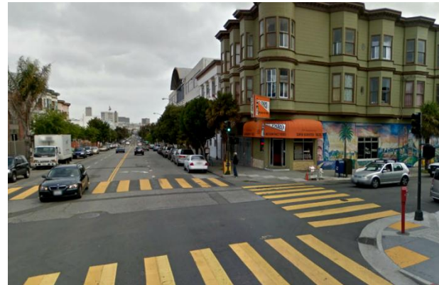
Upgraded traffic signal infrastructure