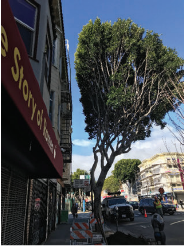
Narrow sidewalk / growth too close to buildings