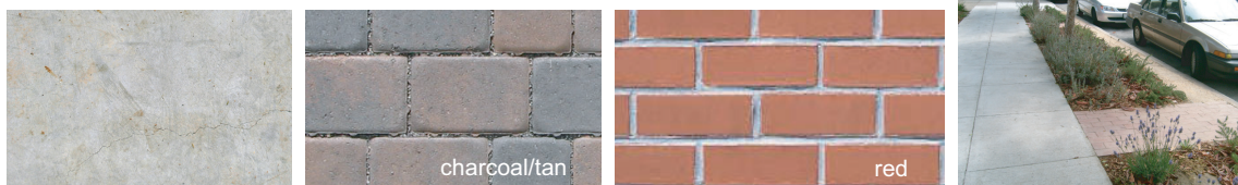
Option 1 Concrete Paving Option 2 Unit Paver on Concrete Base with Mortar Joints (charcoal/tan, red) Example