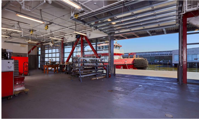
Fire Station 35 at Pier 22½