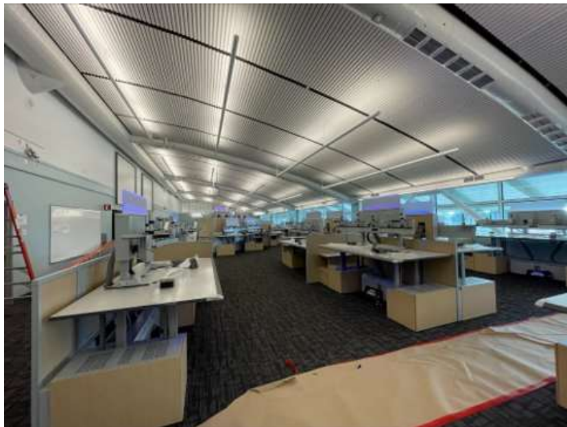
911 Call Center construction at the City's Emergency Operations Center