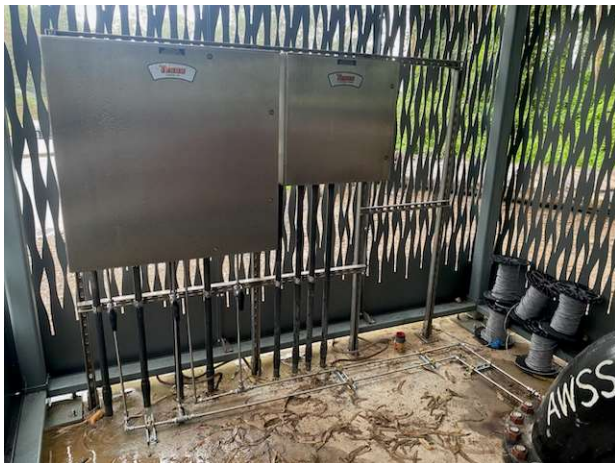
Clarendon Supply Site – SCADA Installation