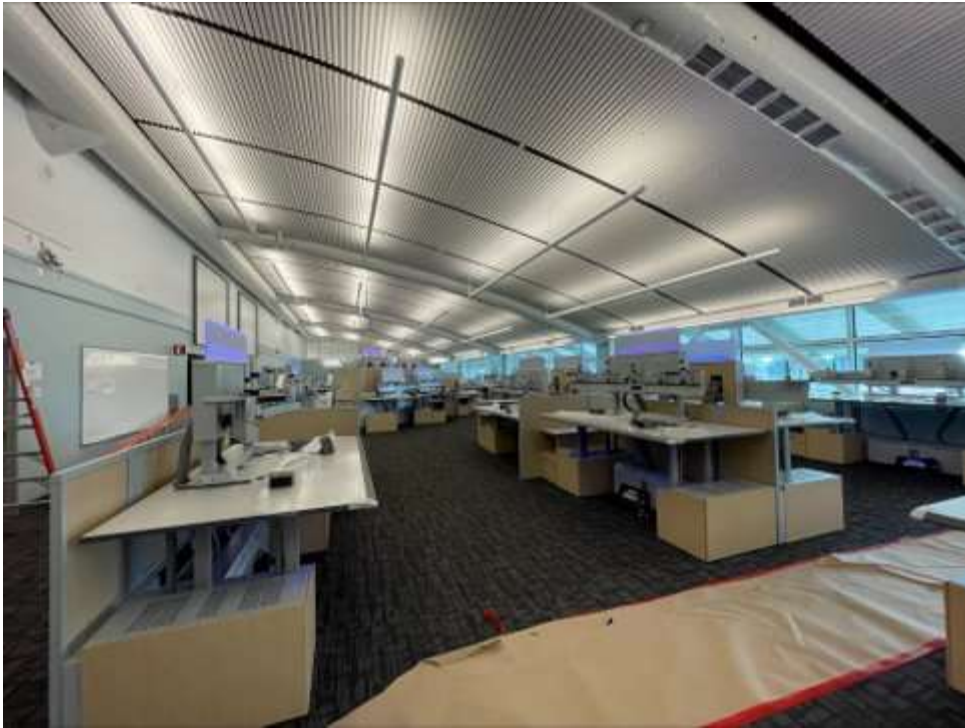
911 Call Center at City's Emergency Operations Center