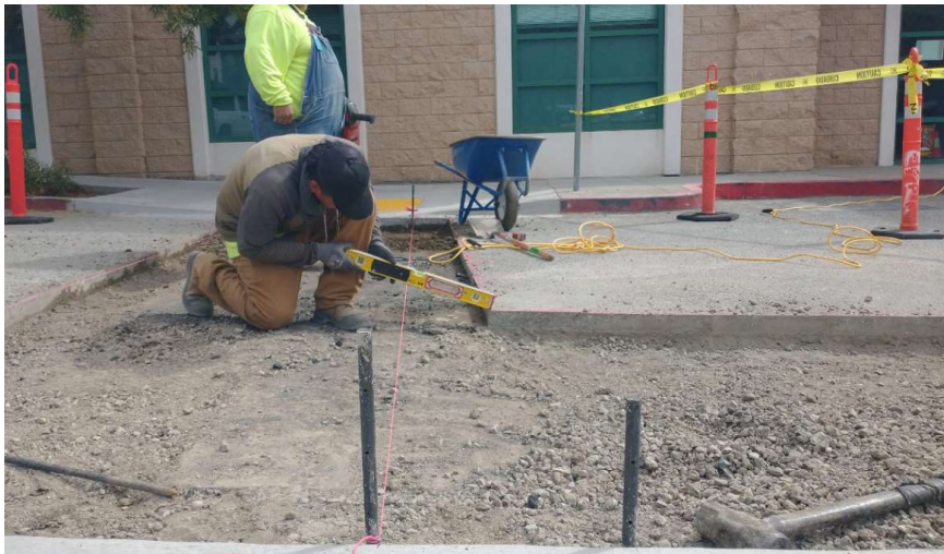
Mission District Police Station

Project Status: Construction was completed in August 2023 and the project is now being closed out.