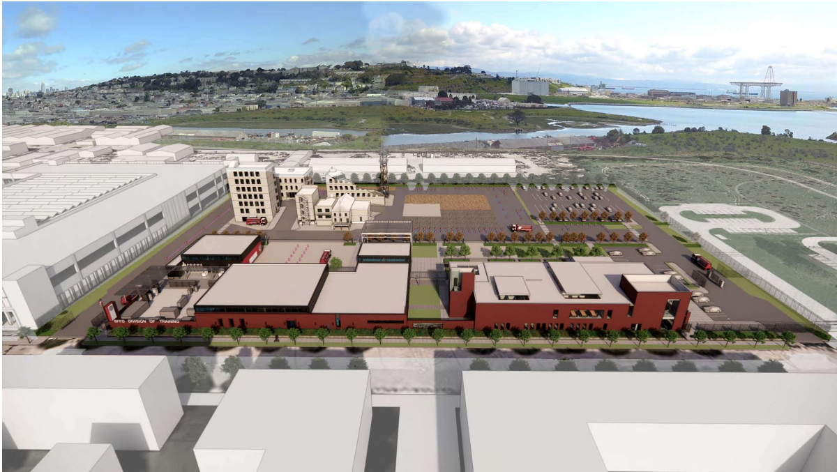
100% Schematic Design (September 2024)