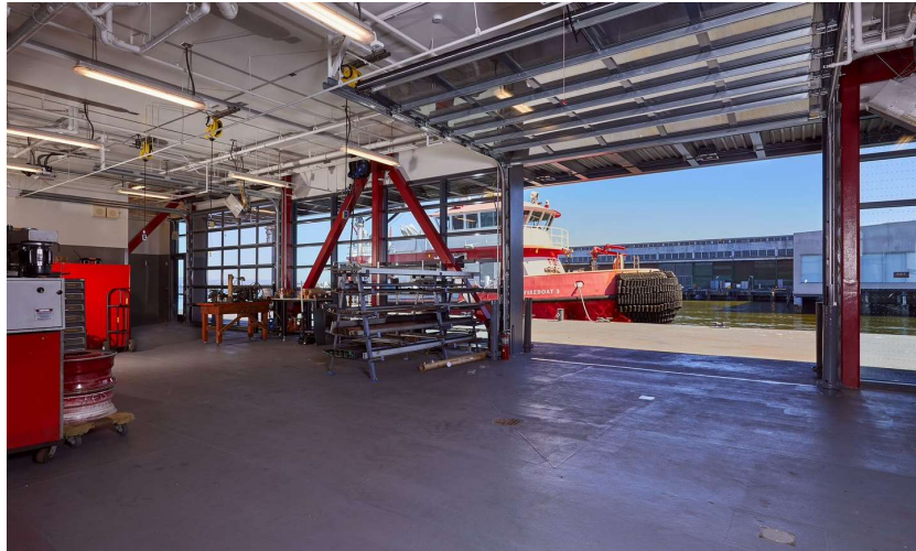
Fire Station 35 at Pier 22½