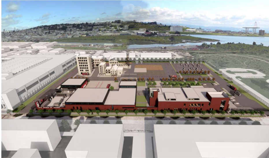
SFFD Division of Training, 100% Schematic Design Rendering, DLR Group