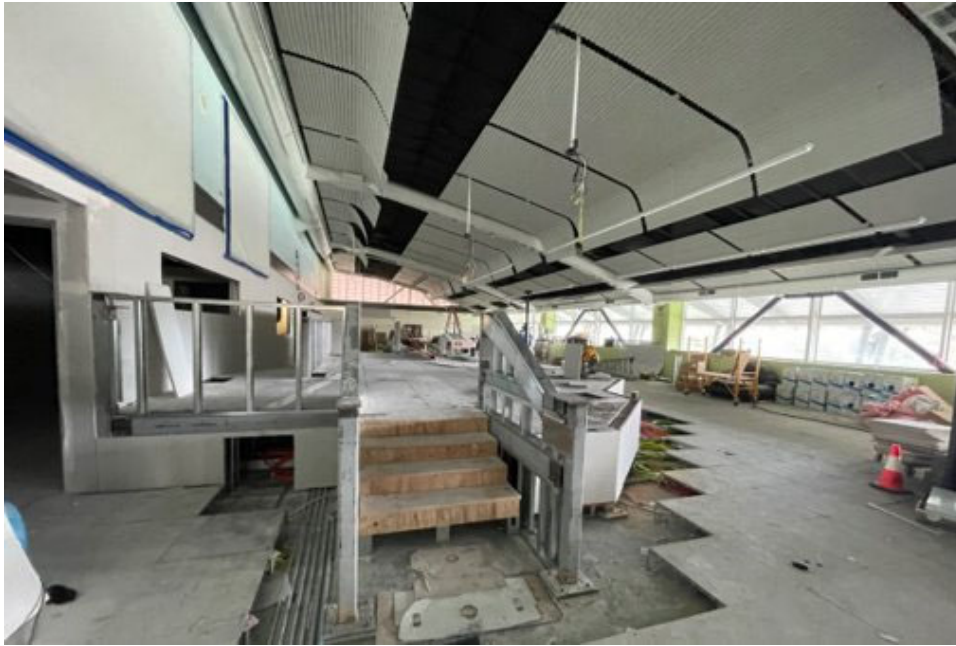
911 Call Center at City's Emergency Operations Center