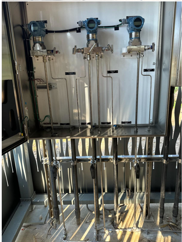
Clarendon Supply Site