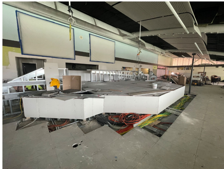
911 Call Center construction at the City's Emergency Operations Center