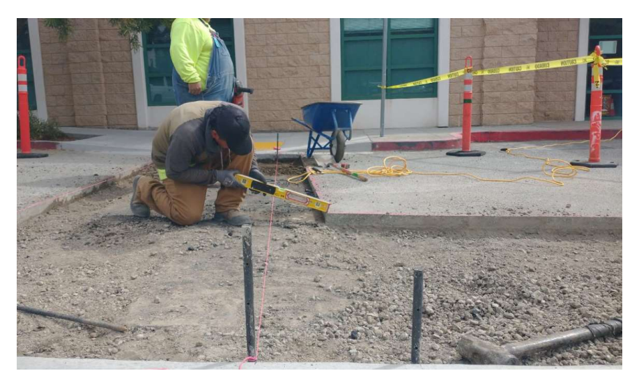
Mission District Police Station

Project Status: Construction was completed in August 2023.