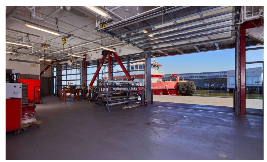
Fire Station 35 at Pier 22½