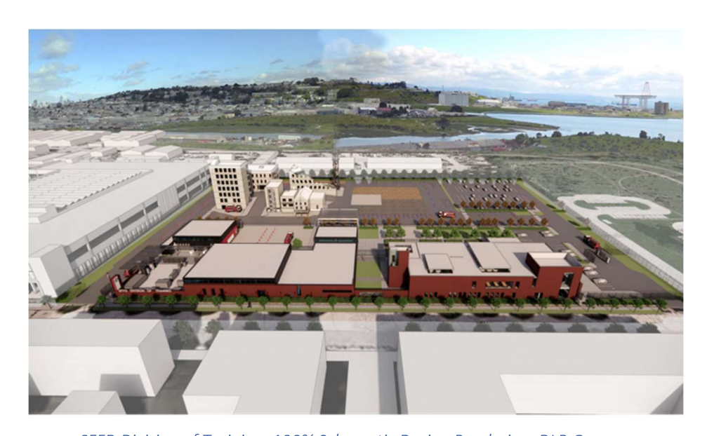
SFFD Division of Training, 100% Schematic Design Rendering, DLR Group