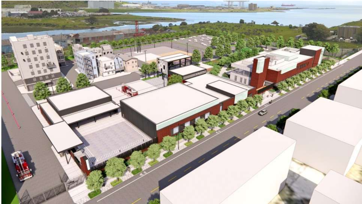
SFFD DOT Overview Rendering – DLR Group