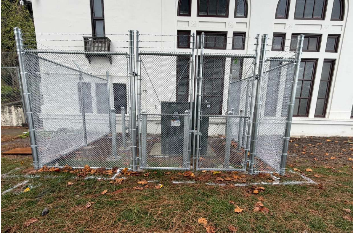
Pumping Station No.2 Electrical equipment installation