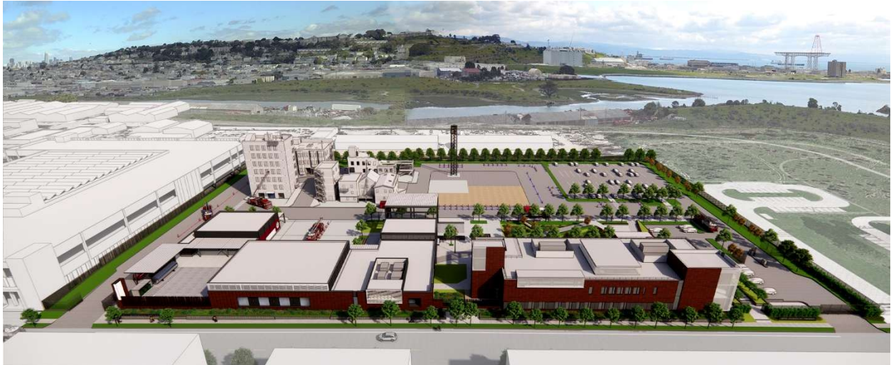
SFFD Division of Training, 50% Design Development Rendering, DLR Group