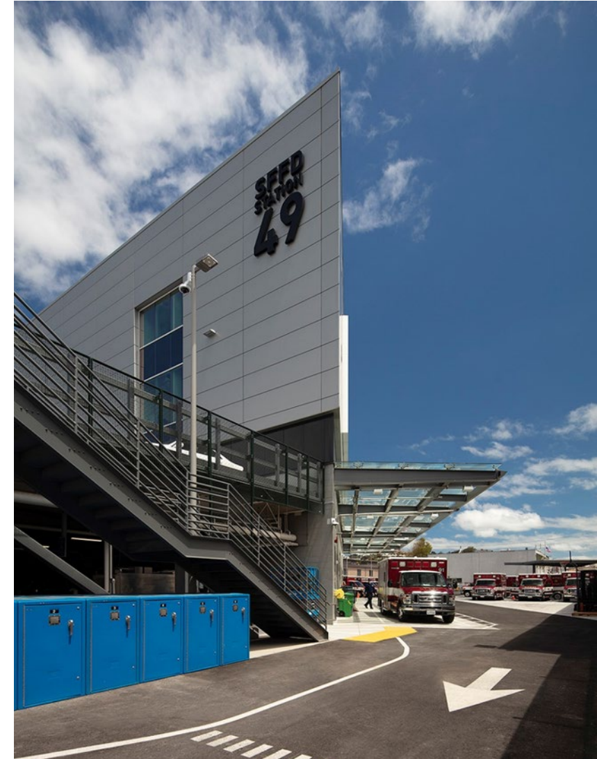
View of garage and south corner of new facility.