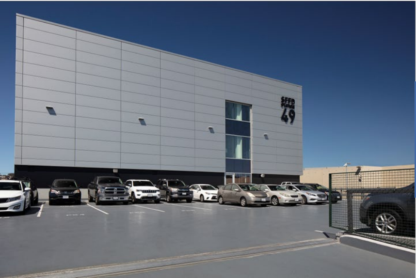
West façade of four-story facility and two-story garage.