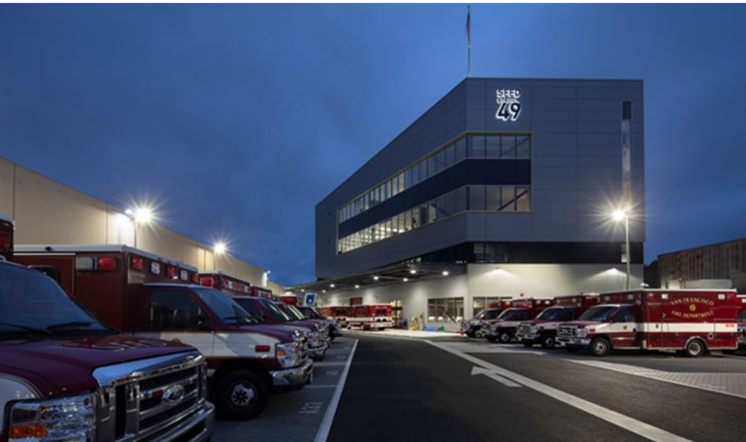
View from Jerrold Avenue of the new Station 49 and ambulance yard.