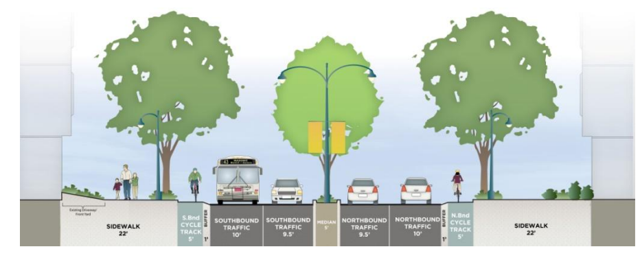
Masonic Avenue Typical Proposed Roadway Section