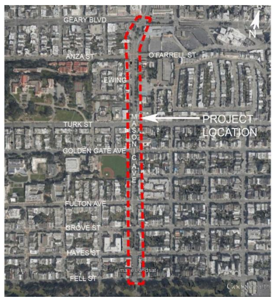
Project boundary from Geary Boulevard to Fell Street