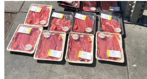
VIOLATION: Selling food or drinks not allowed by the program

If you have any questions, contact Public Works at (628) 271-2000 or Streetvendorpermit@sfdpw.org .