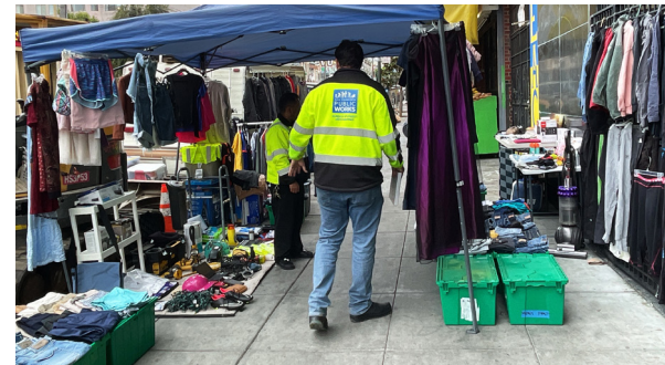
VIOLATION: Obstructing required path of travel

M. Vendors must not interfere with building entrances, driveways, Fire Department connections or access to fire escapes