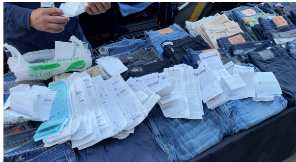
COMPLIANT: Proof of ownership readily available

D. Vendors may not obstruct utilities or other similar facilities located in the right of way