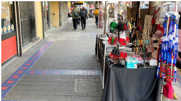
COMPLIANT: 6-foot, straight, unobstructed path of travel maintained

Permit fees shall not exceed $25 for applicants earning less than 200% of area median income or receiving certain public benefits, such as CalWORKs, CalFresh, general assistance, Medi-Cal, Supplemental Security Income, the State Supplementary Payment Program, the California Special Supplemental Nutrition Program for Women, Infants, and Children, the California Alternate Rates for Energy (CARE) program, or the Family Electric Rate Assistance program