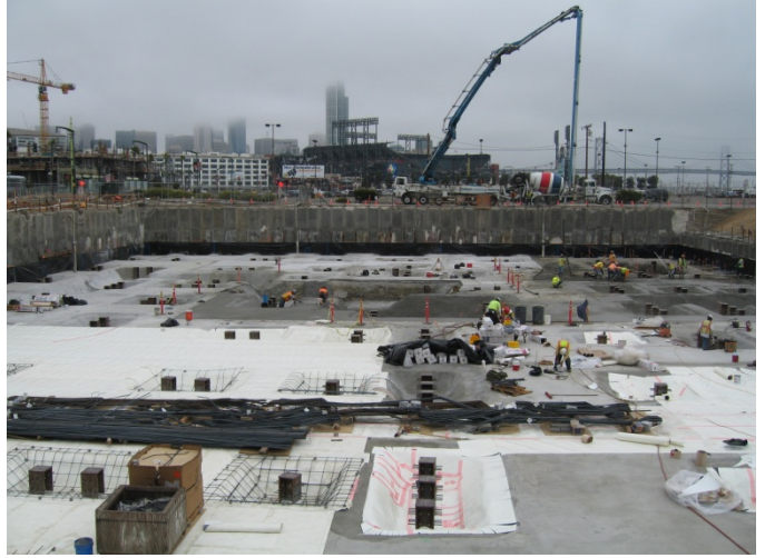
Construction activites at Basment level: mud-slab pour; protection slab installation; subgrade waterproofing; reinforcement at pile caps