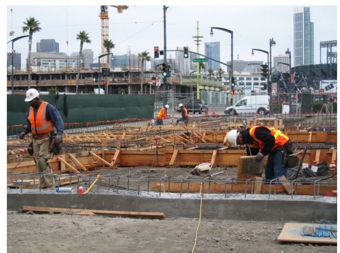
Grade beam construction at Level 1

Project Description: The Public Safety Building (PSB) is meant to provide a new venue for the SFPD Headquarters – effectively the command and control administration of the City's police department-including the relocation of Southern District Station and a new Mission Bay Fire Station. Included in the project is the reuse of Fire Station #30, which will serve as a multi-purpose facility for the Fire Department and the community. Historic resource consultants have determined that the existing fire station is eligible for the National Register of Historic Places. Consistent with the Mission Bay SEIR Addendum No. 7, Mitigation Measures, Item D.02, this facility will be retained and reused in a manner that preserves its historic integrity. The other components of the project will be designed to be respectful of the historic integrity of the existing fire station.