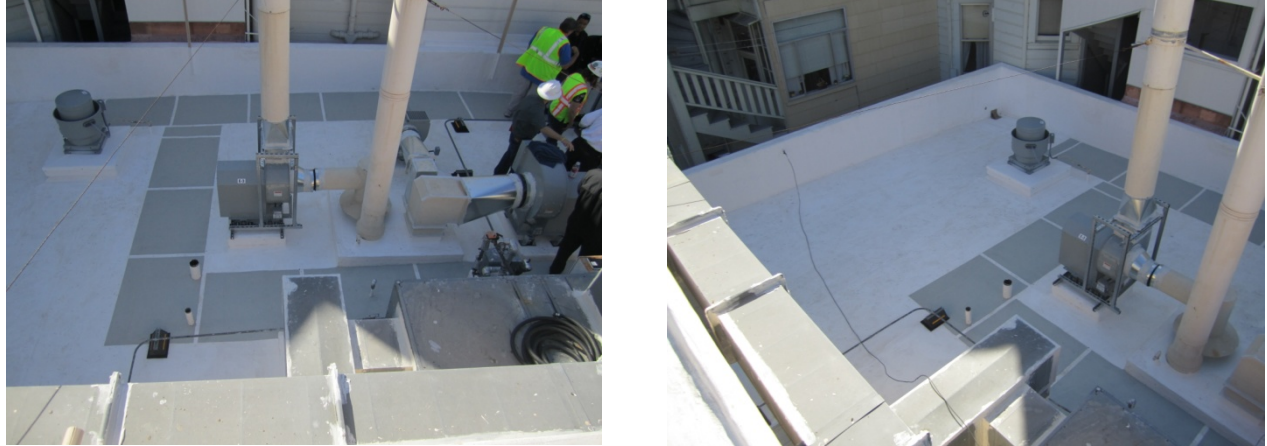
Station #28 Roof Substantially Complete

Project Description: The ESER 1 bond will renovate or replace selected fire stations to provide improved safety and a healthy work environment for the firefighters. The selected stations are determined according to their importance for achieving the most effective delivery of fire suppression and emergency medical services possible.