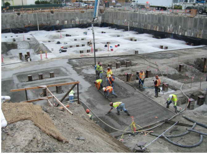
Mud-slab pour and finish at Basement level