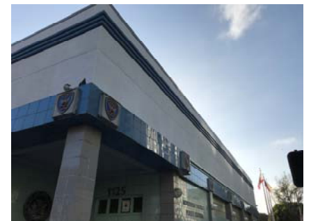
Exterior stucco wall patched, repaired, and painted.