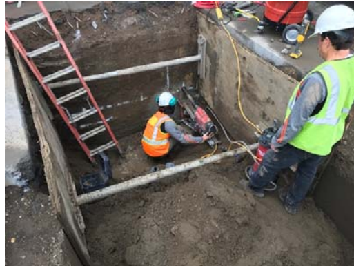
Core Drilling at Sea Wall (March 27, 2019)