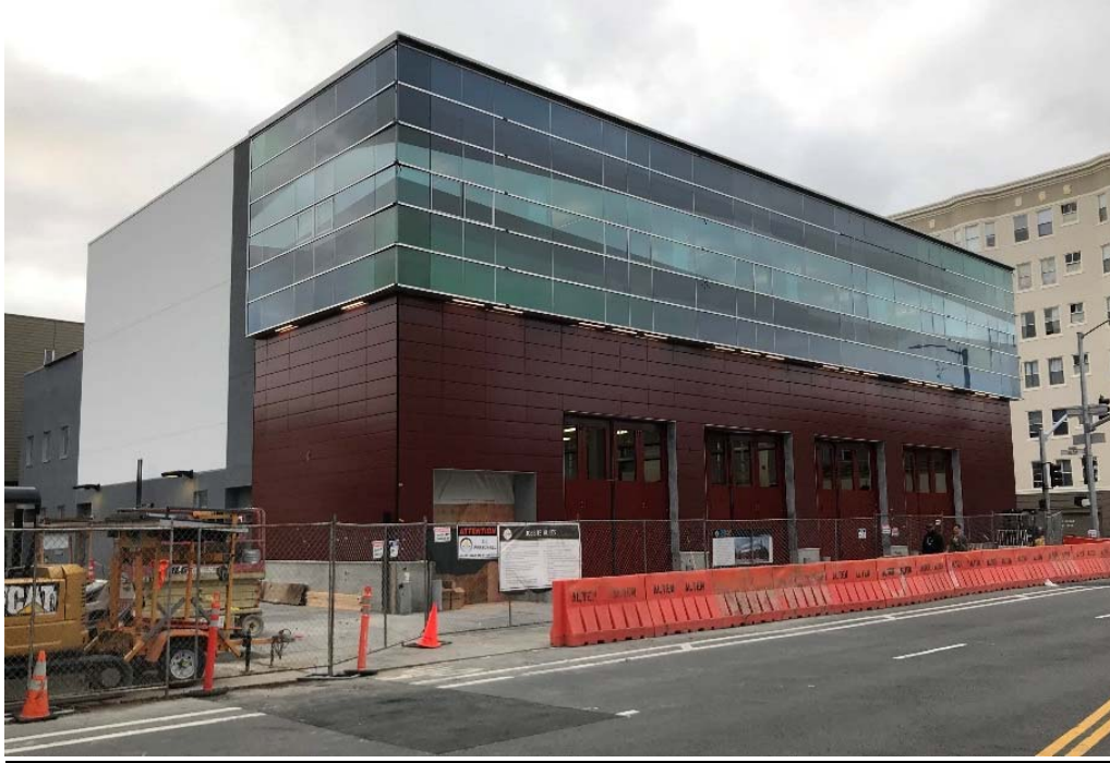
South and East Elevations at Webster Street (April 3, 2019)