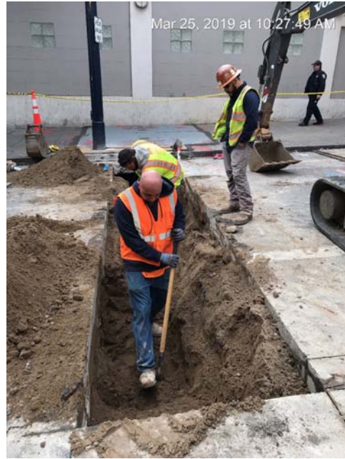
Finishing sewer upgrade on Eddy St.