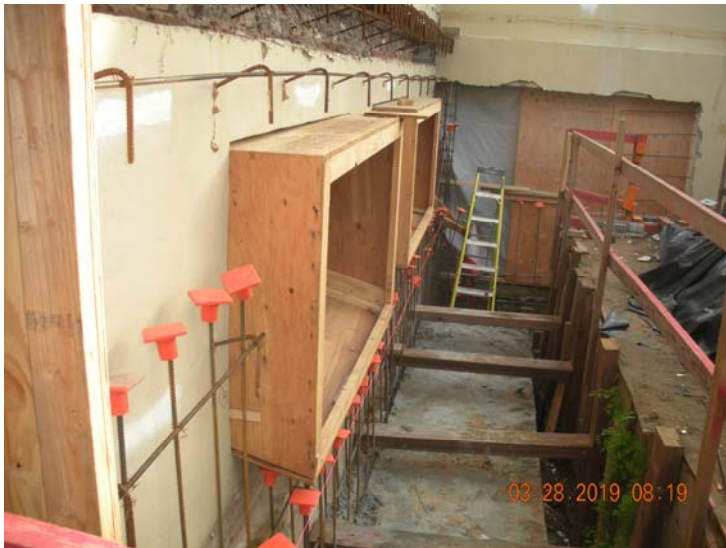
New concrete footing at back of building.