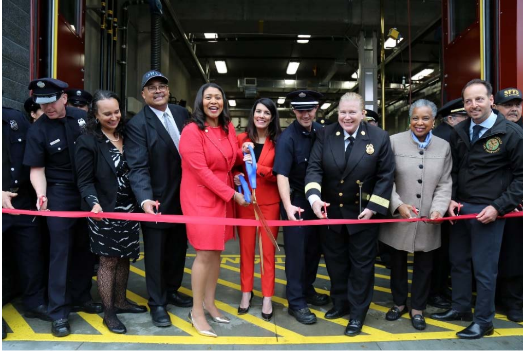
Ribbon Cutting Ceremony (January 31, 2019)