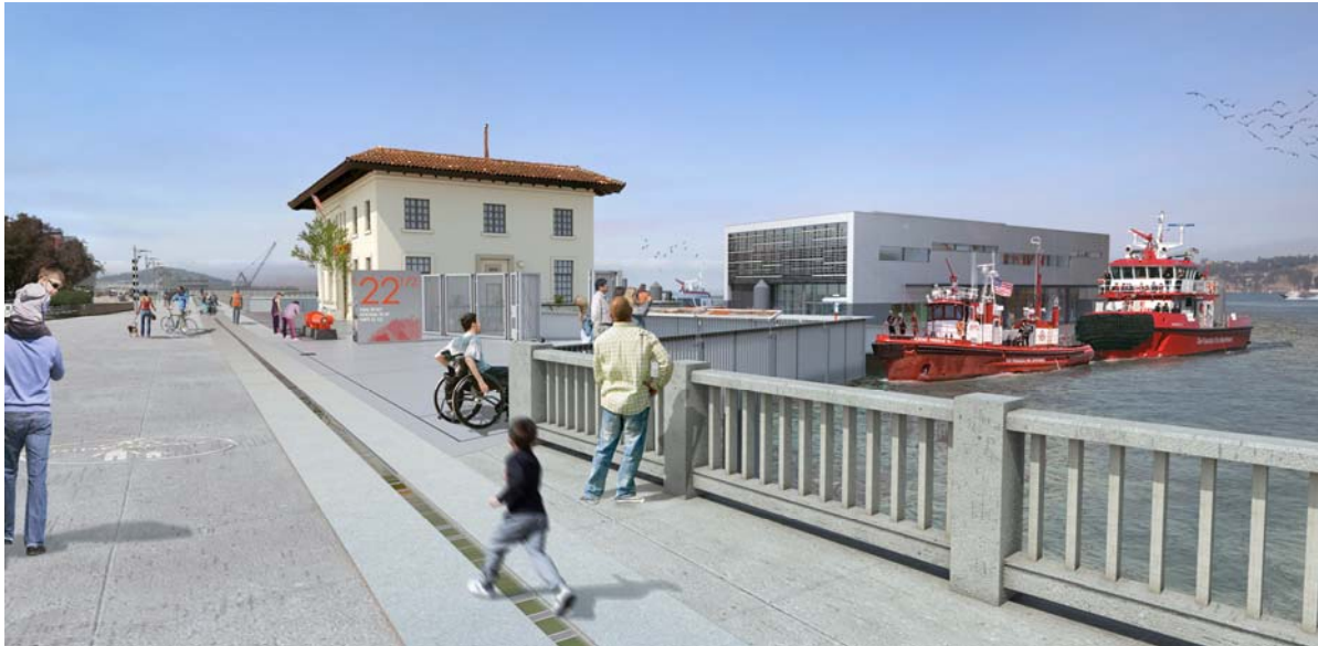
Embarcadero Perspective of West and South Elevations

Design-Builder: Swinerton-Power, JV & Shah Kawasaki Architects