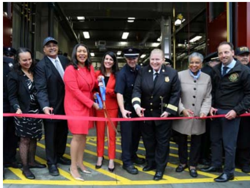
FS 16 – Ribbon Cutting Ceremony (January 31, 2019)