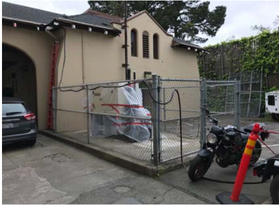
New generator and belly tank.