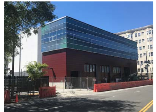
FS 5 – South and East Elevations at Webster St.