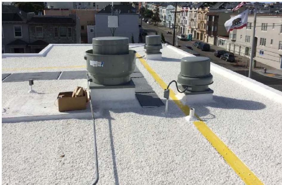
FS 22 Exterior Envelope, new roof