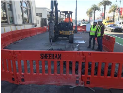
Excavation at Embarcadero (March 21, 2019)