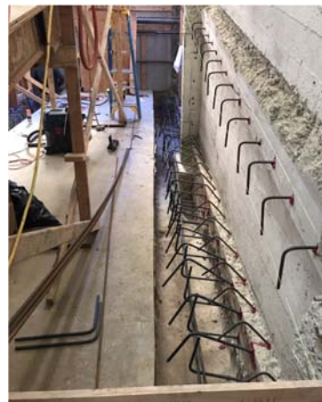
Rebar and dowel for new ramp.