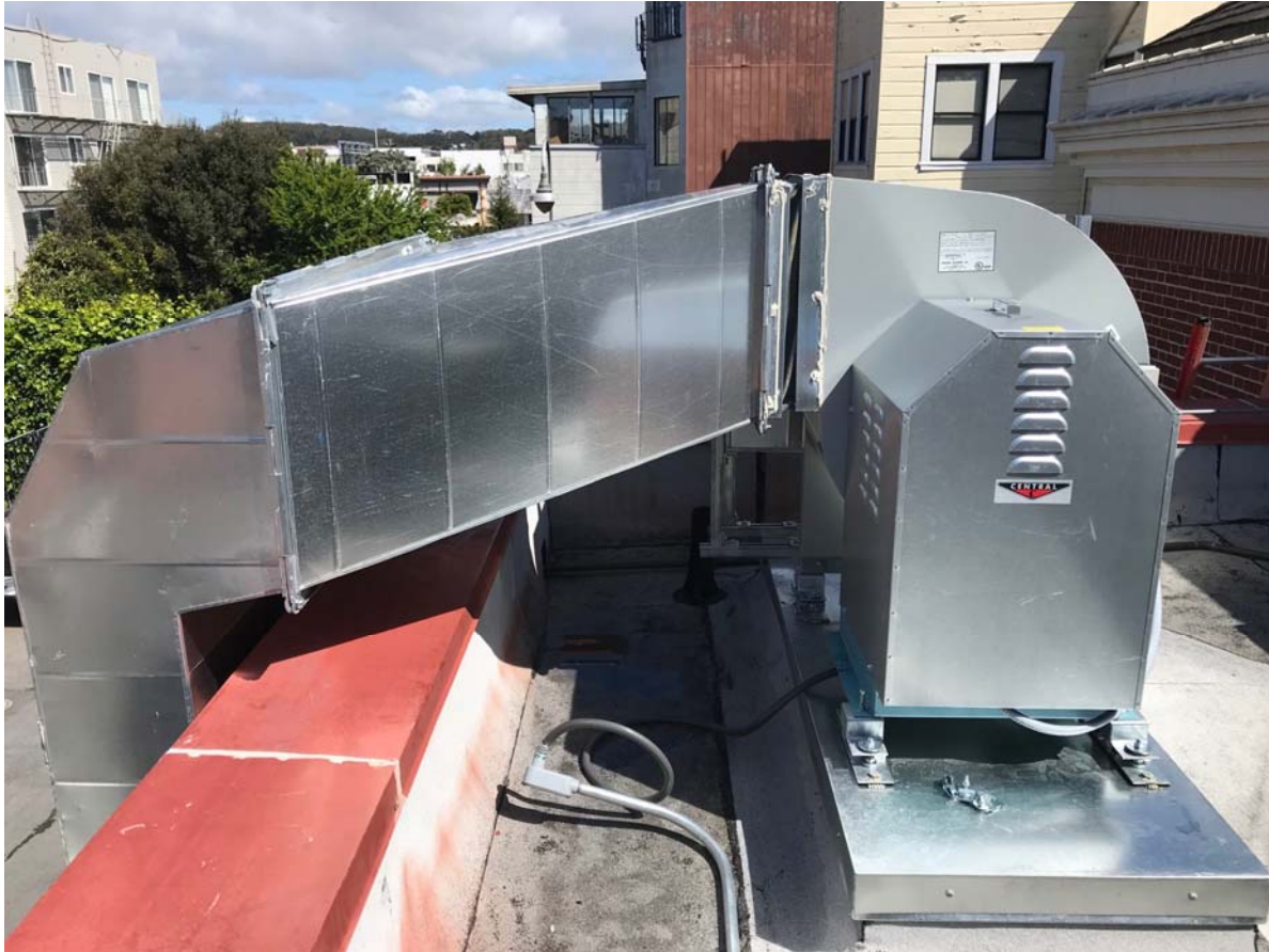
New roof-top supply fan.