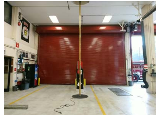
FS 13 Apparatus Bay Doors – Complete