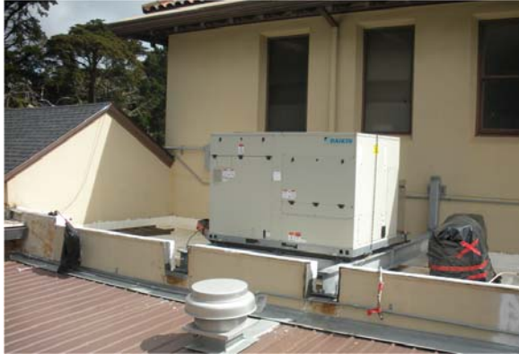
New AC unit installed on roof.