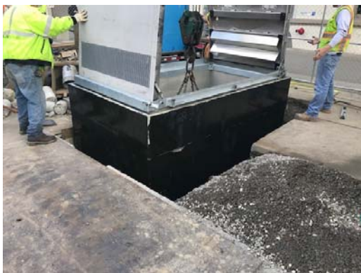
Set PG&E Transformer Vault (March 29, 2019)