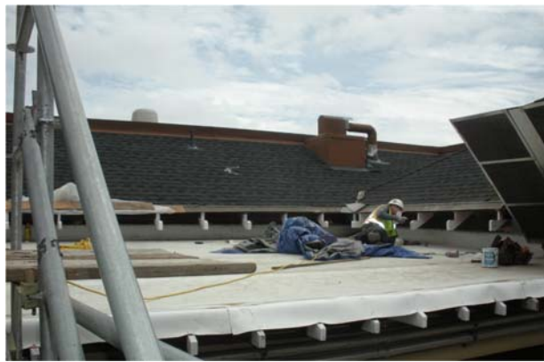
Rafter tail replacement.

The following was completed at Ingleside Station: