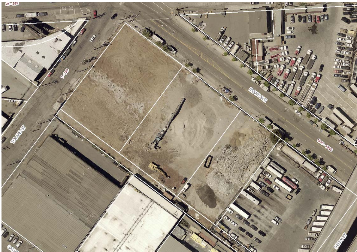
Aerial Photo of 1995 Evans Avenue Post-Demolition (2018)

Project Description: The project will relocate the SFPD Forensic Services Division (FSD) and SFPD Traffic Company (TC) to a site located at 1995 Evans Avenue, San Francisco. The amount of space requested for the Traffic Company was determined based on the Police Facilities Master Planning Study dated August 23, 2012.