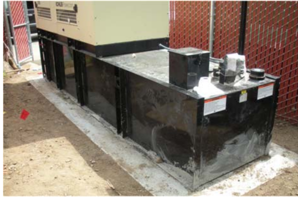
New generator and belly tank.