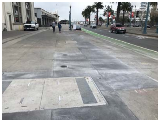
New Concrete Sidewalk (April 4, 2019)