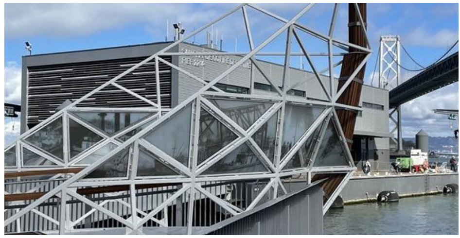
Public Art Sculpture, BOW, by Hood Design Studio (Photo: 10/18/21)

During the current reporting period, the work continued on the installation of the security fencing, guardrails, the public art sculpture - BOW , and sitework along the Embarcadero. Water service installation was completed in November 2021. Gas, sewer service and permanent power were provided in mid-December 2021.