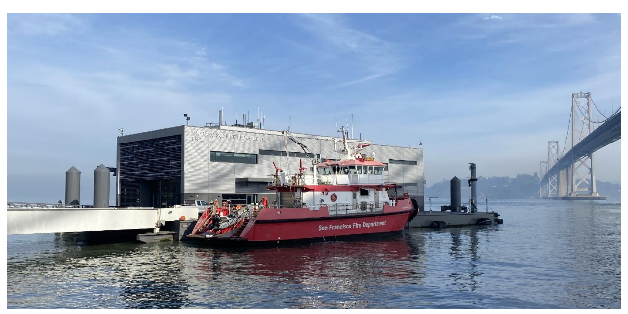
Fireboat Station 35 at Pier 221/2