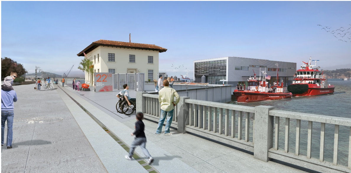
Embarcadero Perspective of West and South Elevations

Design-Builder: Swinerton-Power, a Joint Venture and Shah Kawasaki Architects