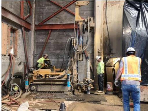
Pumping Station 2 at Fort Mason – In Progress

sfpublicworks.org facebook.com/sfpublicworks twitter.com/sfpublicworks