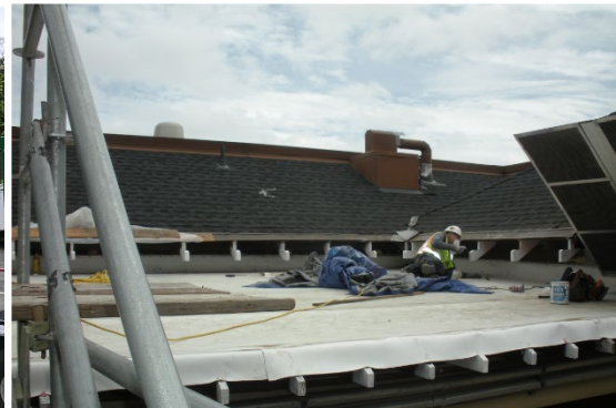
Rafter tail replacement.