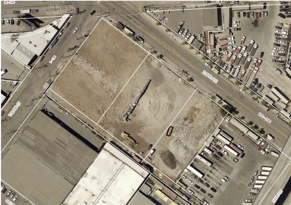
Aerial Photo of 1995 Evans Avenue Post-Demolition (2018)

Project Description: The project will relocate the SFPD Forensic Services Division (FSD) and SFPD Traffic Company (TC) to a site located at 1995 Evans Avenue, San Francisco. The amount of space requested for the Traffic Company was determined based on the Police Facilities Master Planning Study dated August 23, 2012.