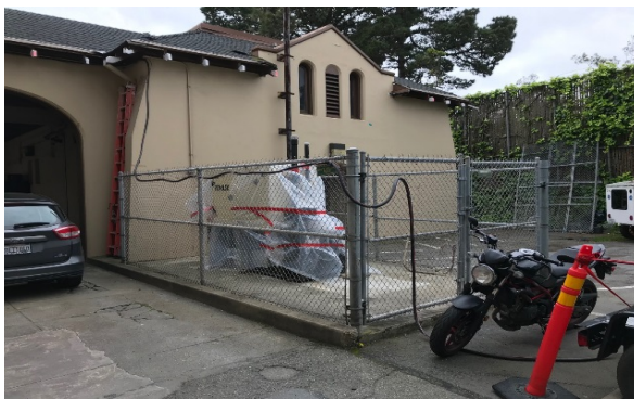
New generator and belly tank.