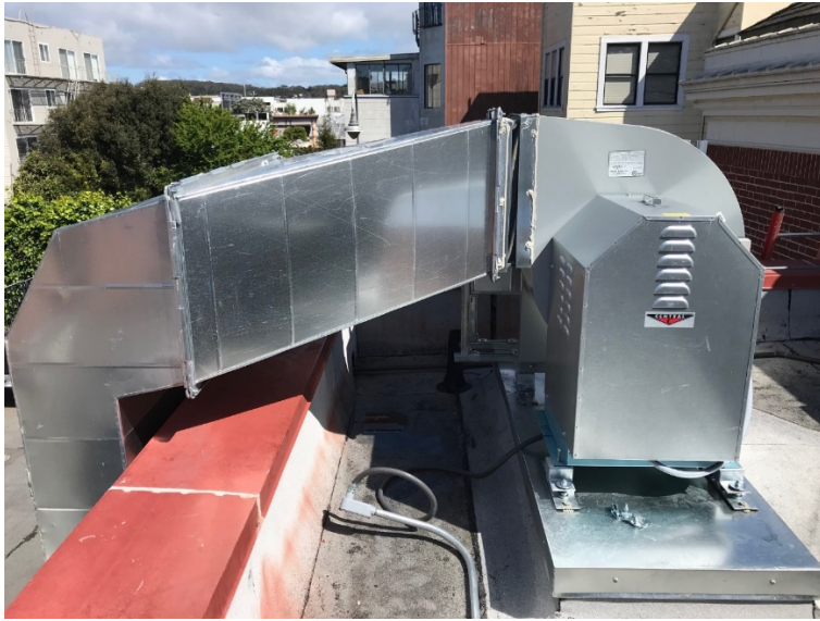
New roof-top supply fan.