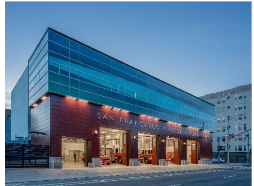
FS 5 – Complete