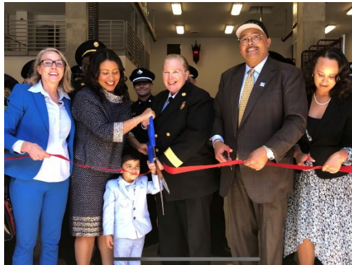
FS 5 – Ribbon Cutting Ceremony (May 1, 2019)