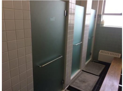
FS 17 – Shower Renovation