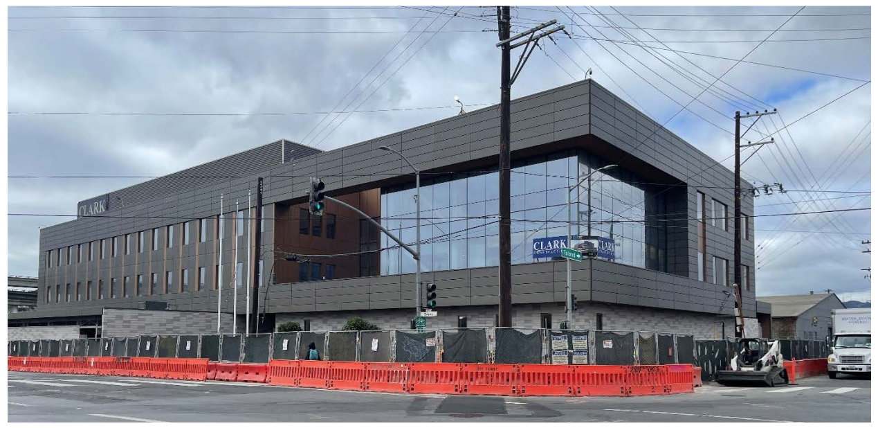
Traffic Company & Forensic Services Division at 1995 Evans Avenue