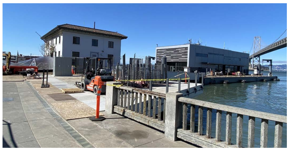
Construction Progress at New Observation Deck (Photo: 6/24/21)

During the current reporting period, the interior build-out and structural strengthening of the north and south aprons were completed, jib cranes were installed on the float deck, work began on installation of the security fencing and guardrails at the aprons and new observations deck, and PG&E vault was installed at Pier 22½. The first quarter of FY21-22 will see installation of the public art sculpture, BOW , designed by Hood Design Studio and completion of sitework.