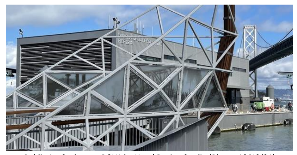
Public Art Sculpture, BOW, by Hood Design Studio (Photo: 10/18/21)

During the current reporting period, the work continued on the installation of the security fencing and guardrails, the public art sculpture, BOW , and sitework along the Embarcadero began. The second quarter of FY21-22 will see completion of sitework and restoration of the Embarcadero and final utility connections to the new facility.