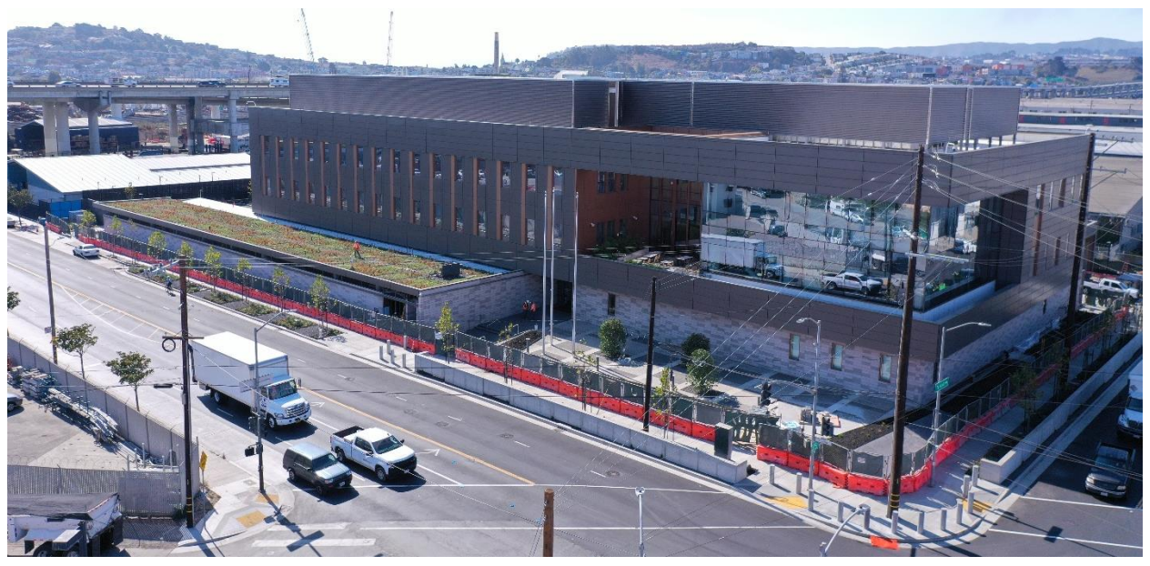
Traffic Company & Forensic Services Division at 1995 Evans Avenue